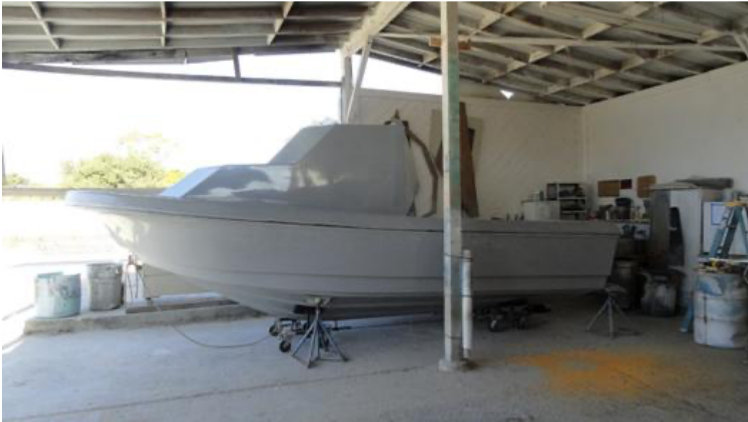
The hull and cabin are bonded together