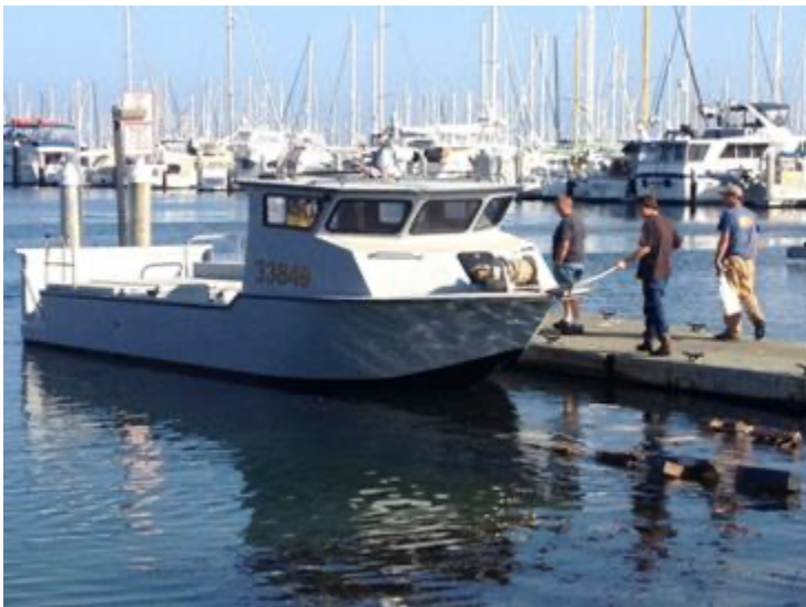
After: Back in the water and ready for work!