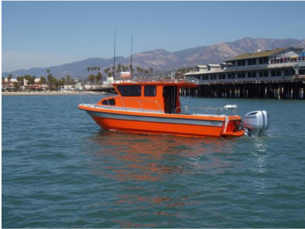
First sea trial