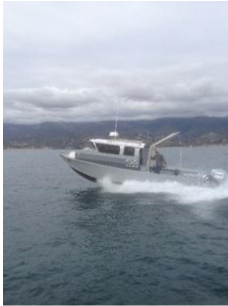
Mike Malloy going for a boat ride