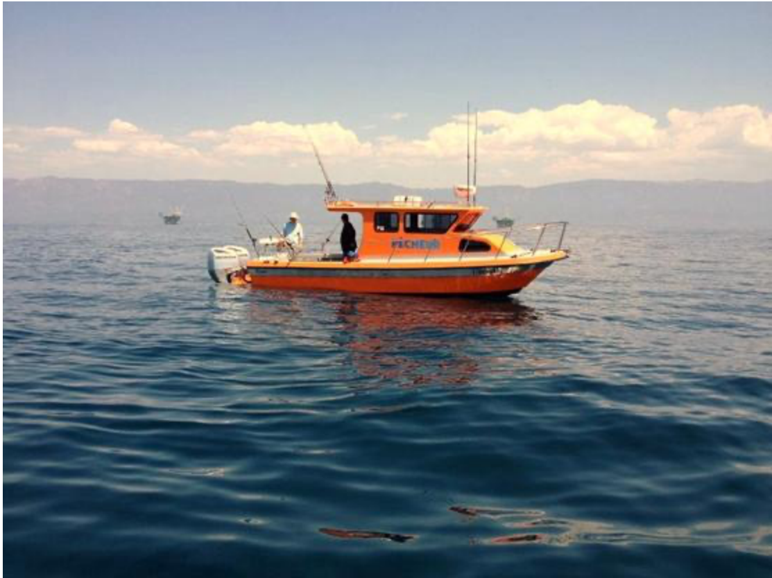
-Above, photo credit Mark Lyons-