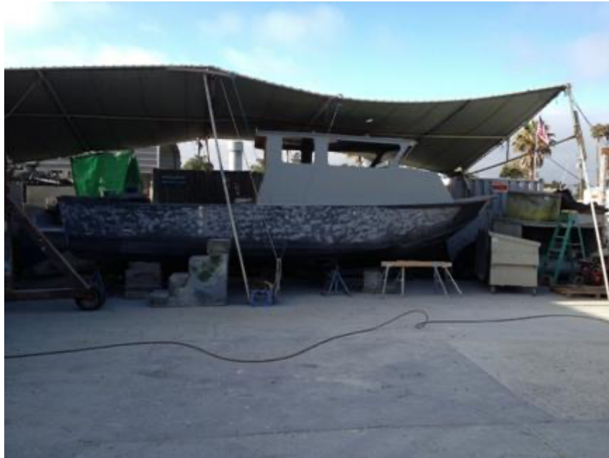
The whole boat sanded and cabin primed