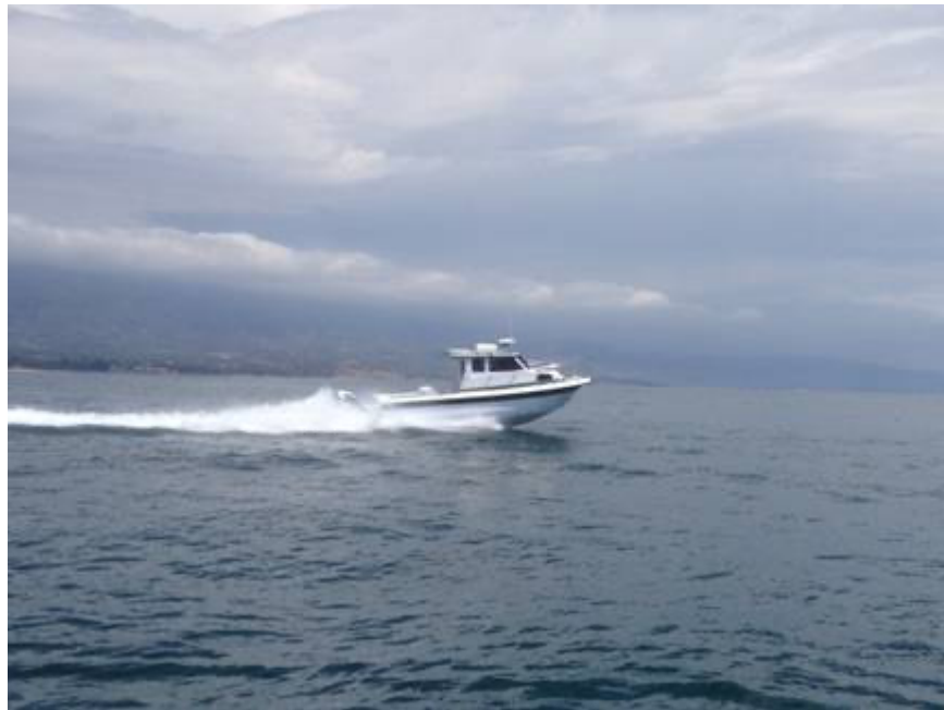
First day in the water