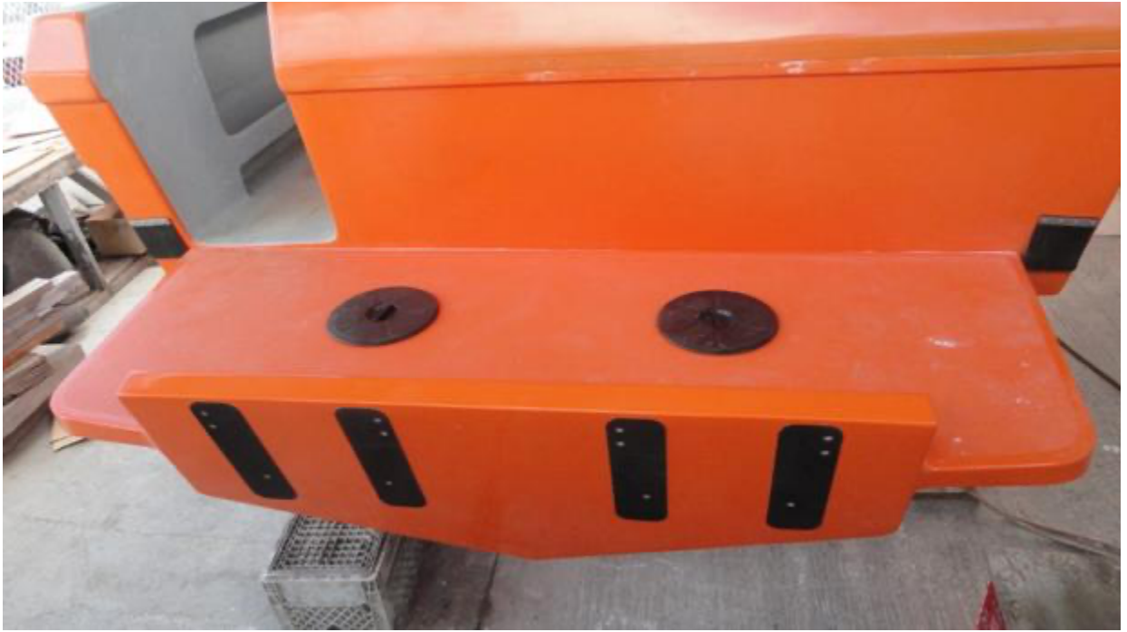
Armstrong bracket/swim step on