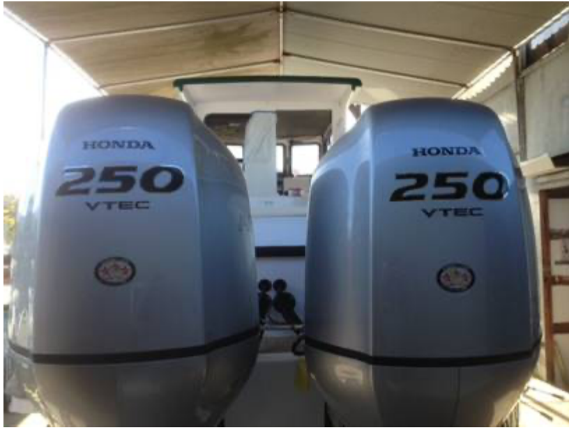
The twin Honda 250's are mounted on an Armstrong swim step bracket