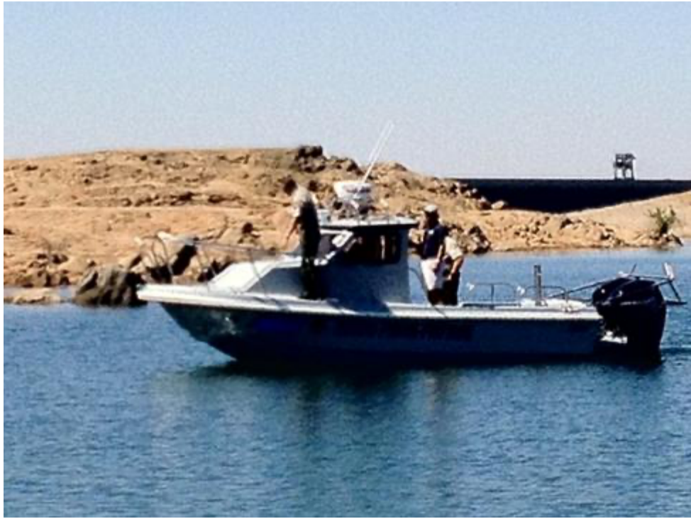
Sea trial on Millerton Lake