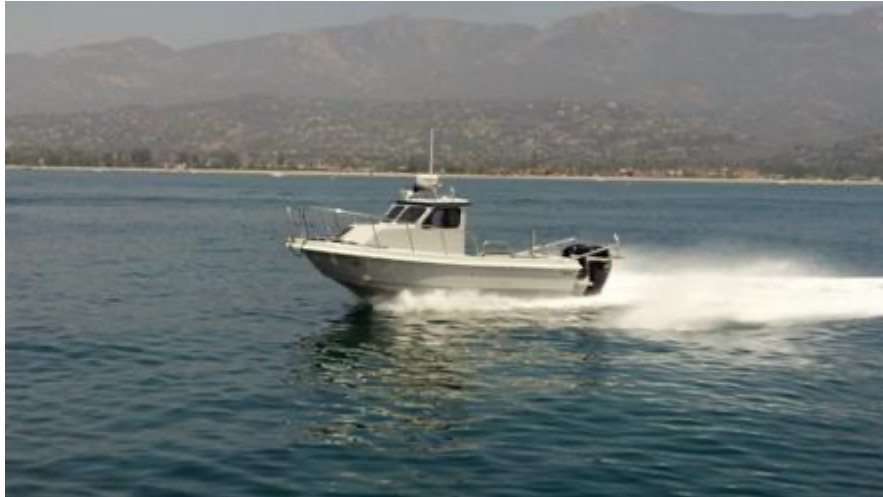
Running in the Santa Barbara channel