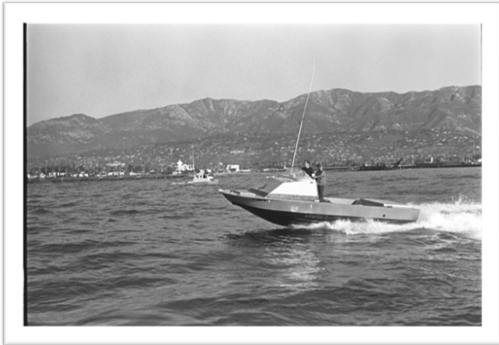
24' Radoncraft in the Santa Barbara Channel