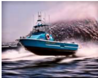
Scott also took the photos below.