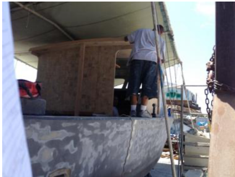
Building the back of the cabin