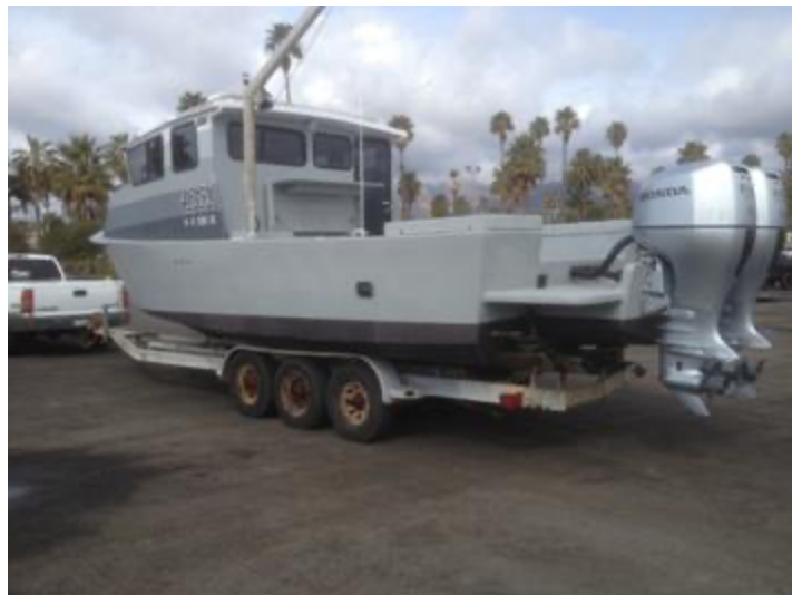
At the Santa Barbara launch ramp