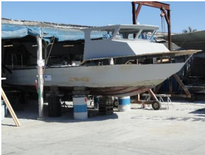
New cabin and raising the bow