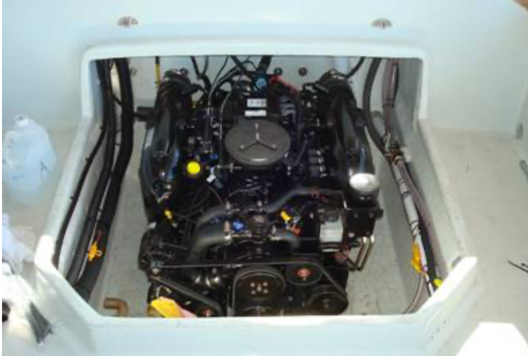
Ron's new 22' has a 300 HP Mercruiser engine...