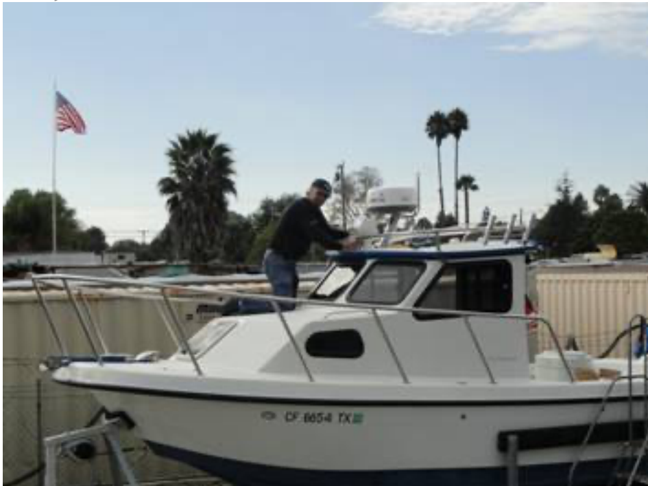
And Don checks it out