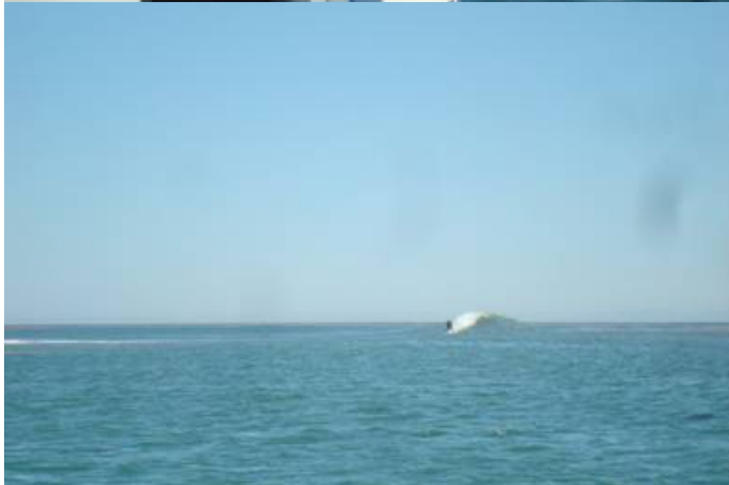
We restore the Santa Barbara Harbor Patrol's 32' Radon Before...