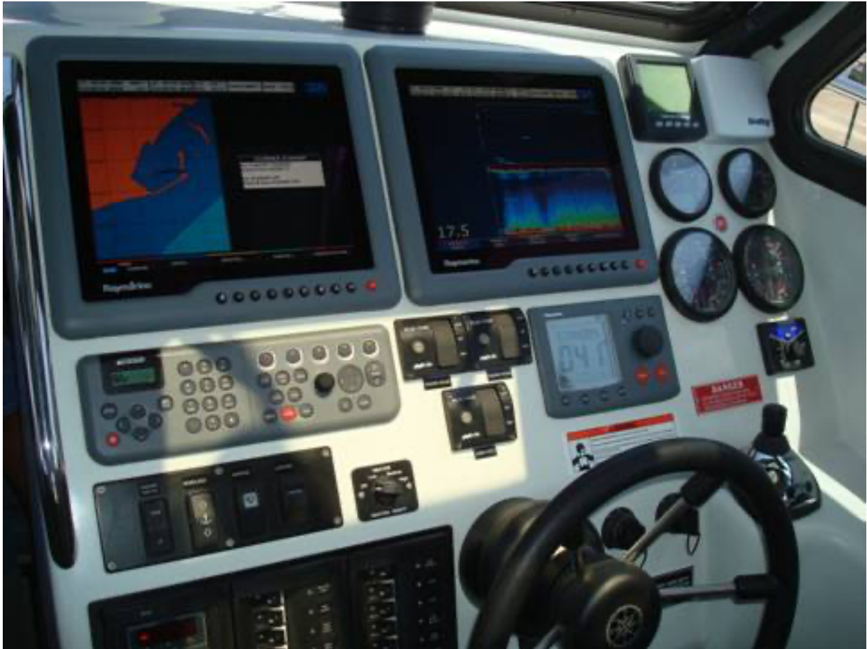
The Command Center