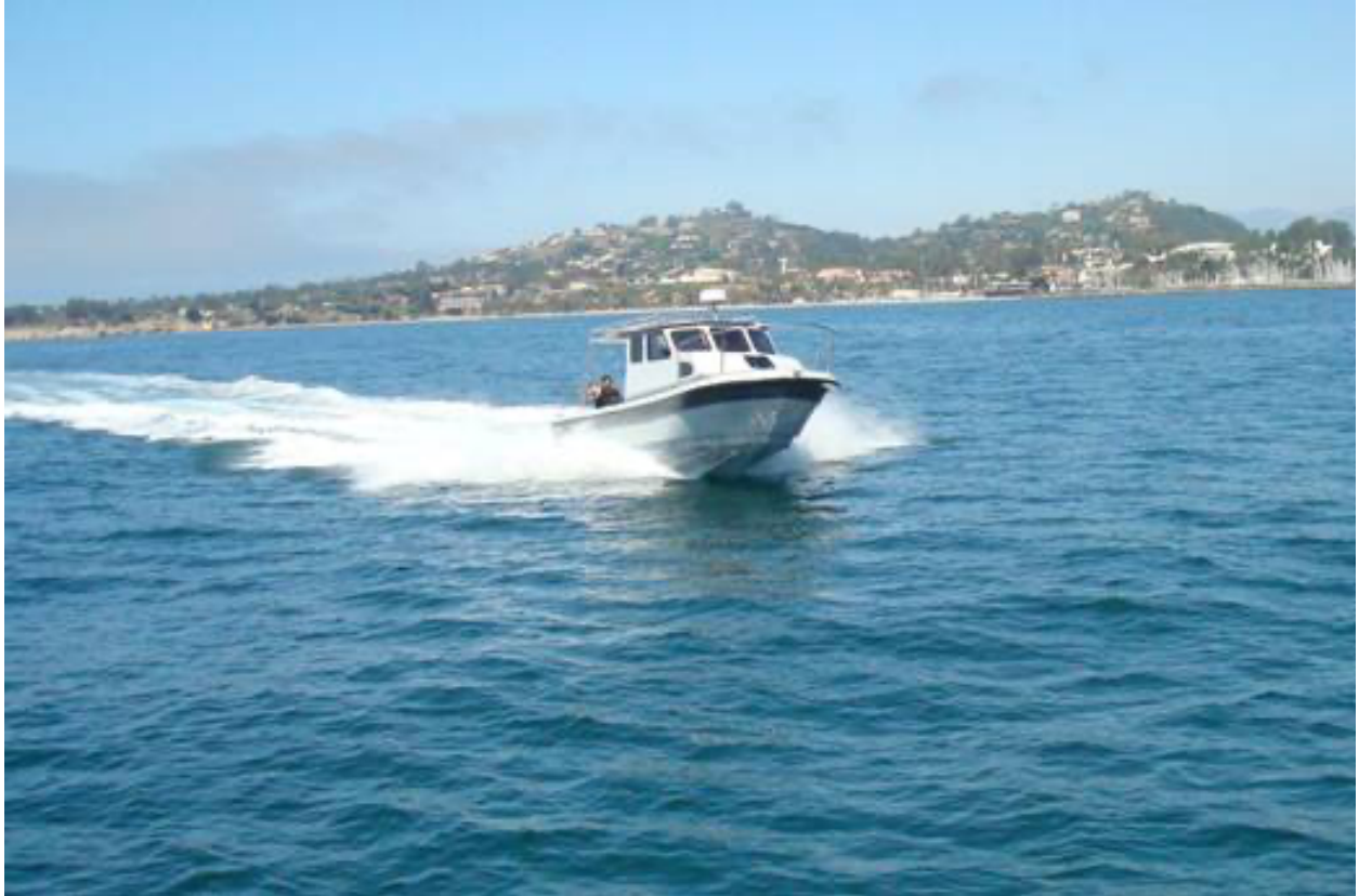
Our crew goes for a ride on the new 26' x 8'6" Radon Classic