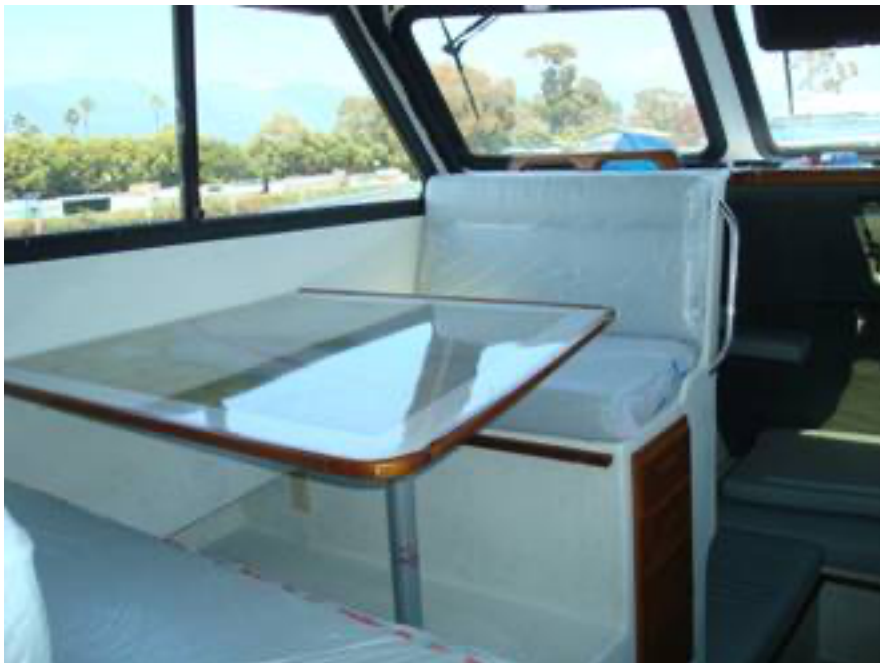
The dinette and table with the Channel Island's map on it