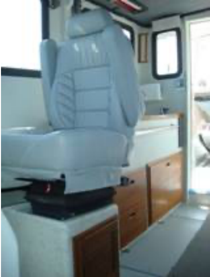
The helm seat with galley aft - the large teak door has an...ice chest inside