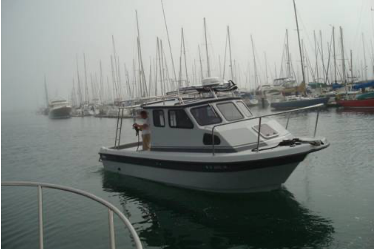
Jeremy gets the tie-up lines ready at the launching ramp