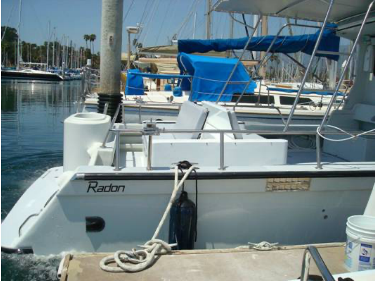
The above photo shows the fold-down seat built by Hendrix Manufacturing, as well as the swim step and built-in fiberglass bait tank.