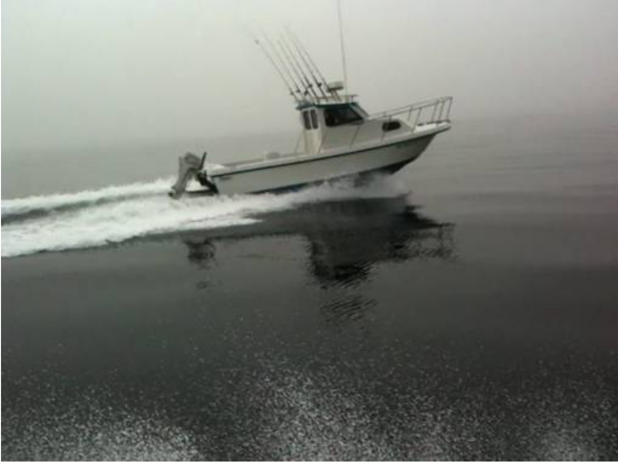
Ron's boat on the way to the Channel Islands