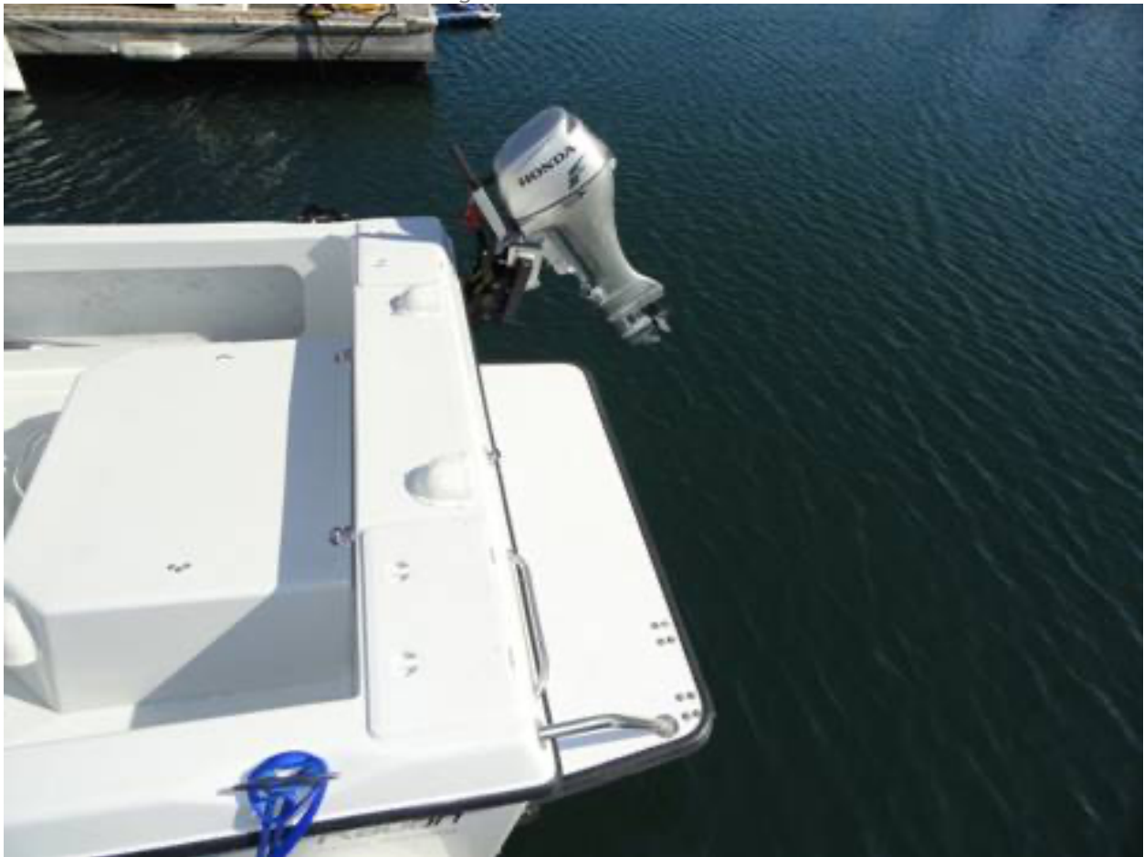
as well as a 9.9 HP Honda kicker