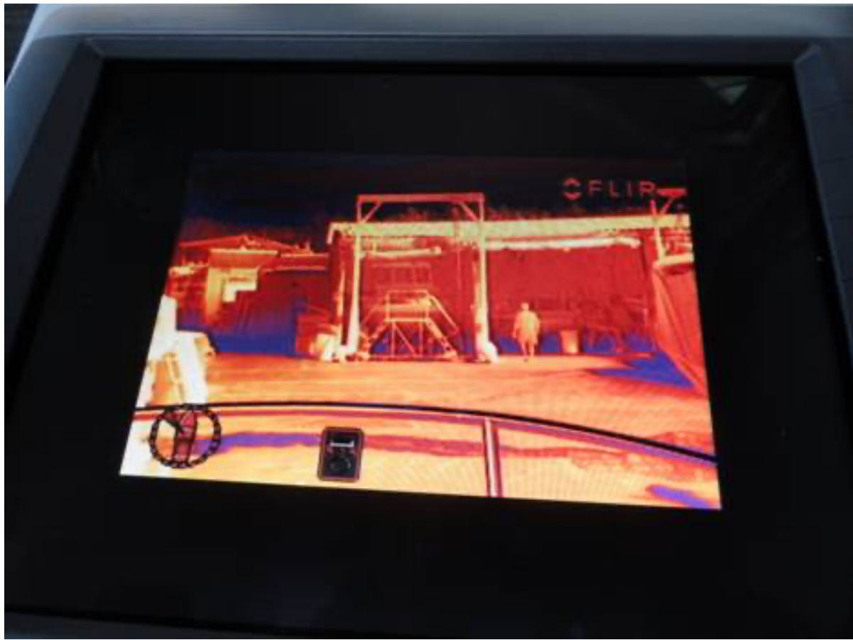
It is also equipped with a Flir night vision camera