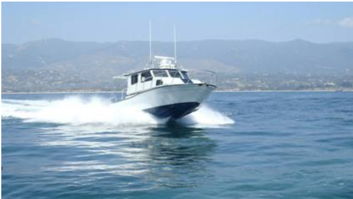
Running in the Santa Barbara channel