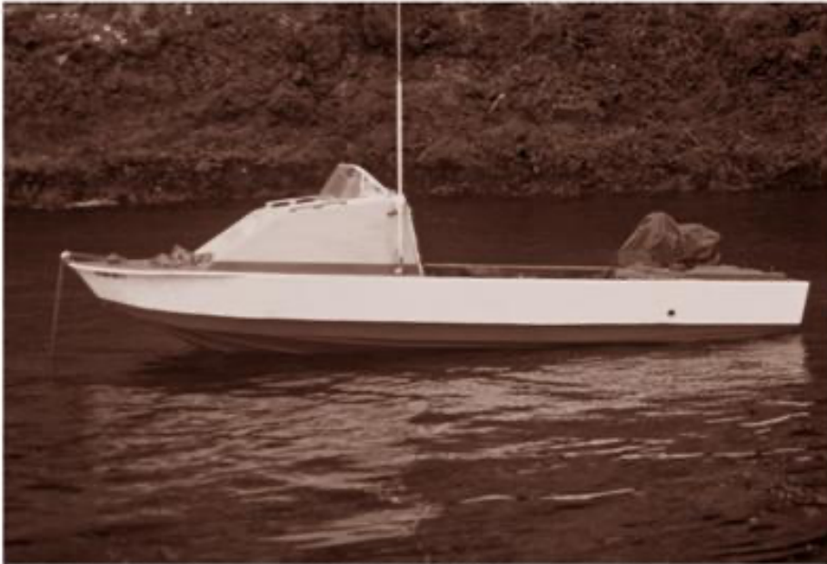
RADON 24 1972