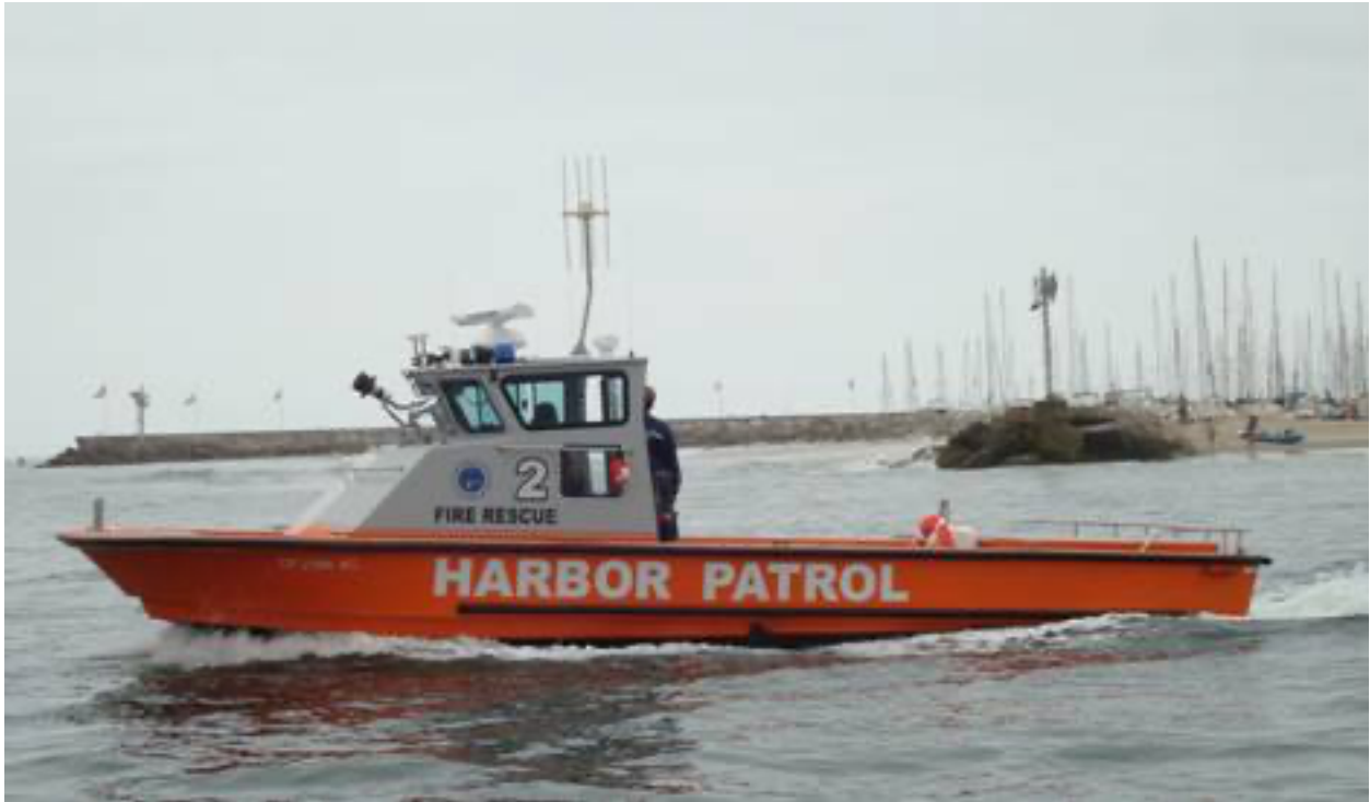
Back on patrol! P.J.'s Fiesta parade!