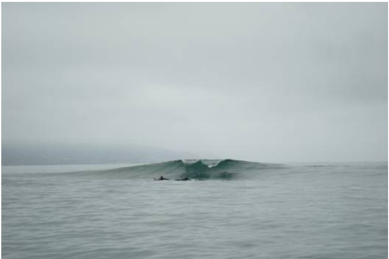
They were the two best surfers out that day!