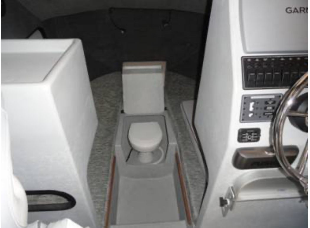
The sea-water head