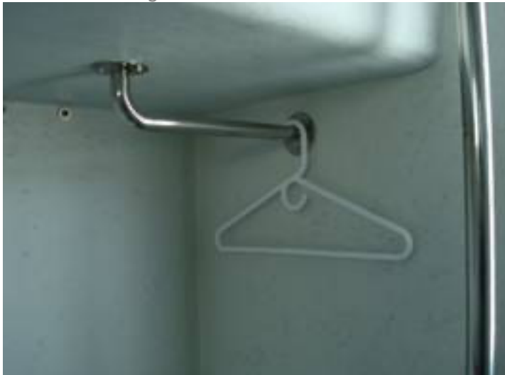
The 36' Radon has a walk-in head and shower with a wetsuit hanger