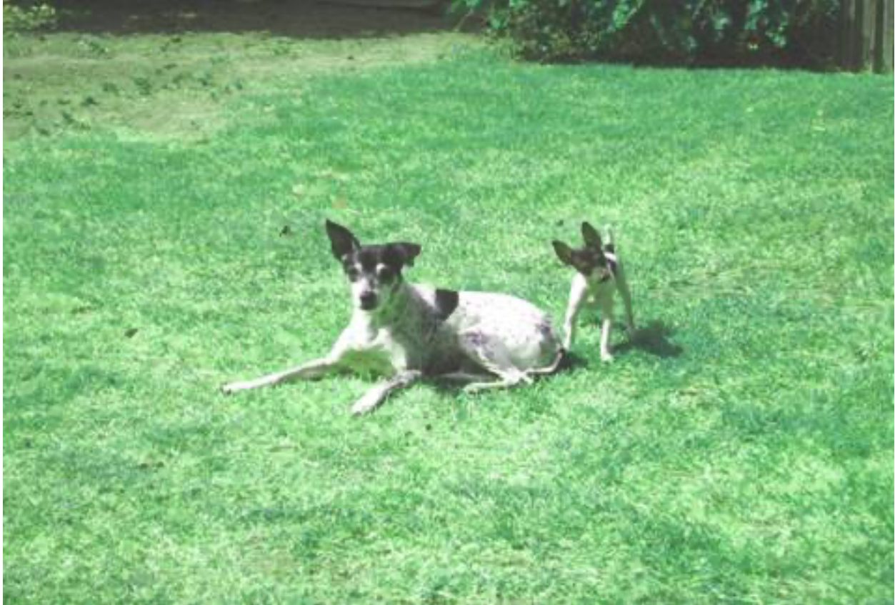
Above: Two Terriers? Are you insane?