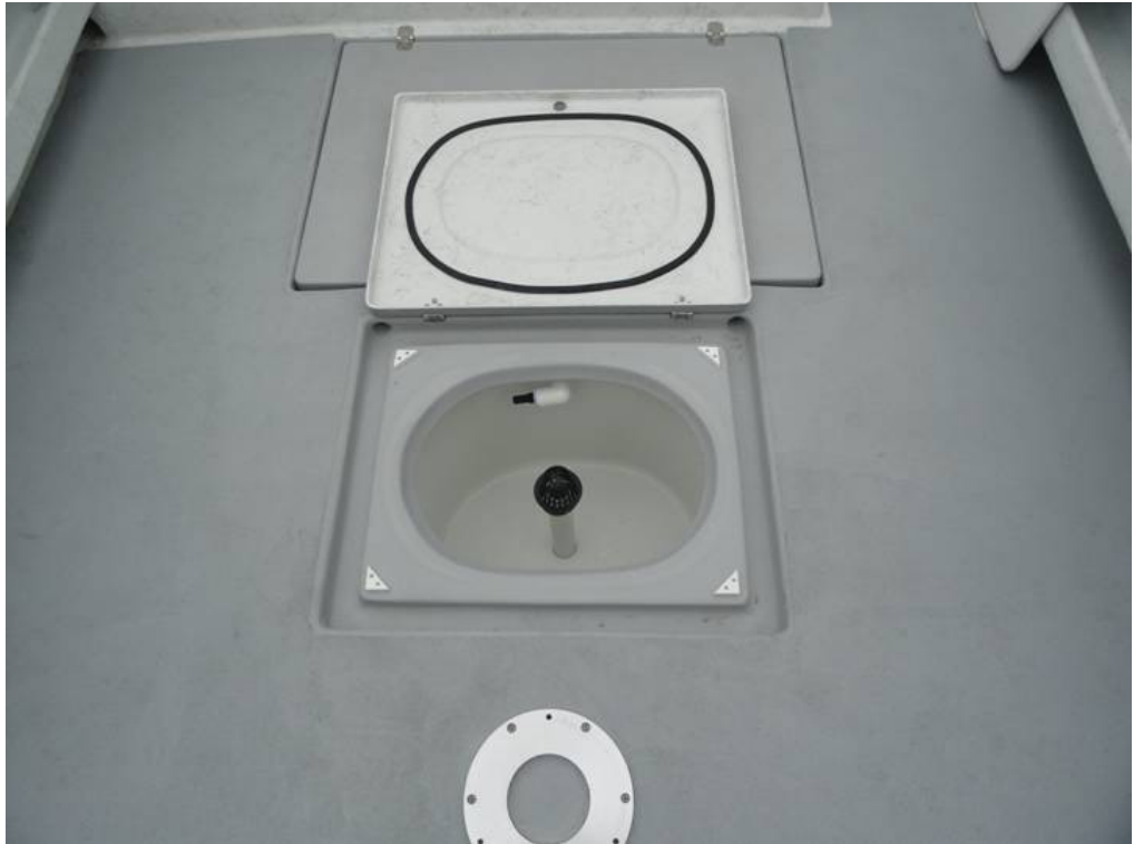
Live well and fighting chair ring mount