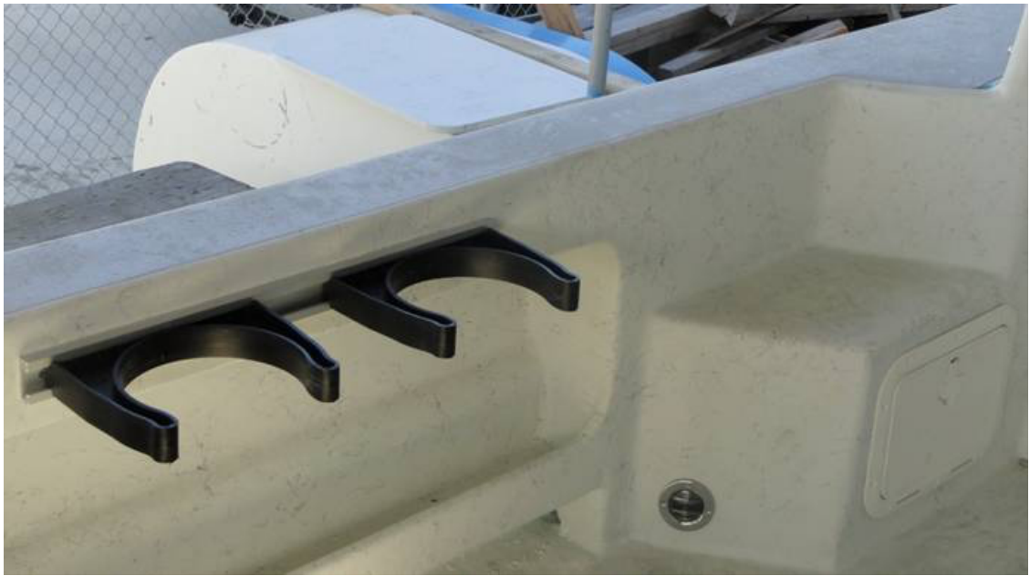
Dive tank racks for easy storage