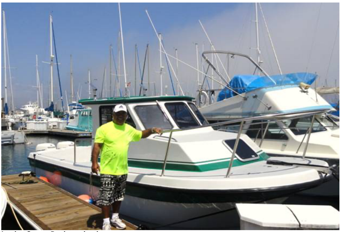
In the Santa Barbara harbor