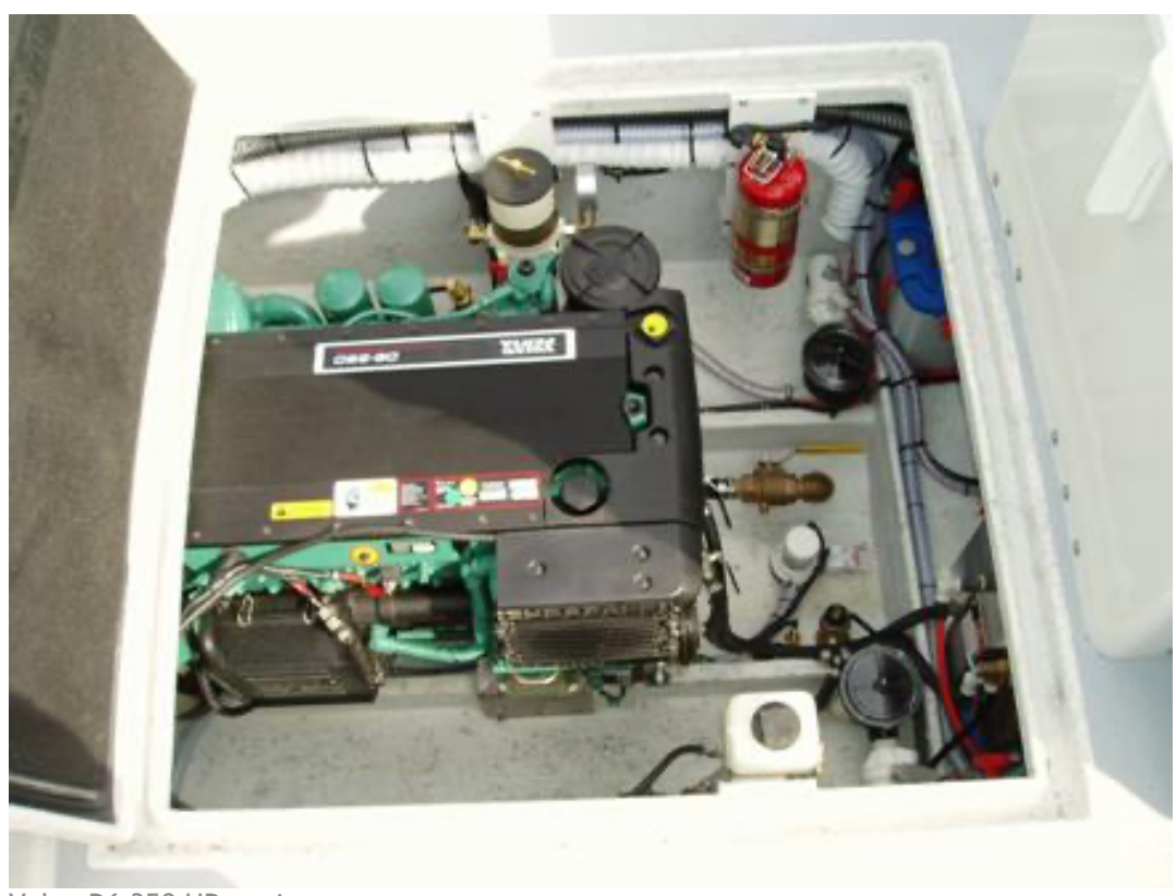
Volvo D6 350 HP engine