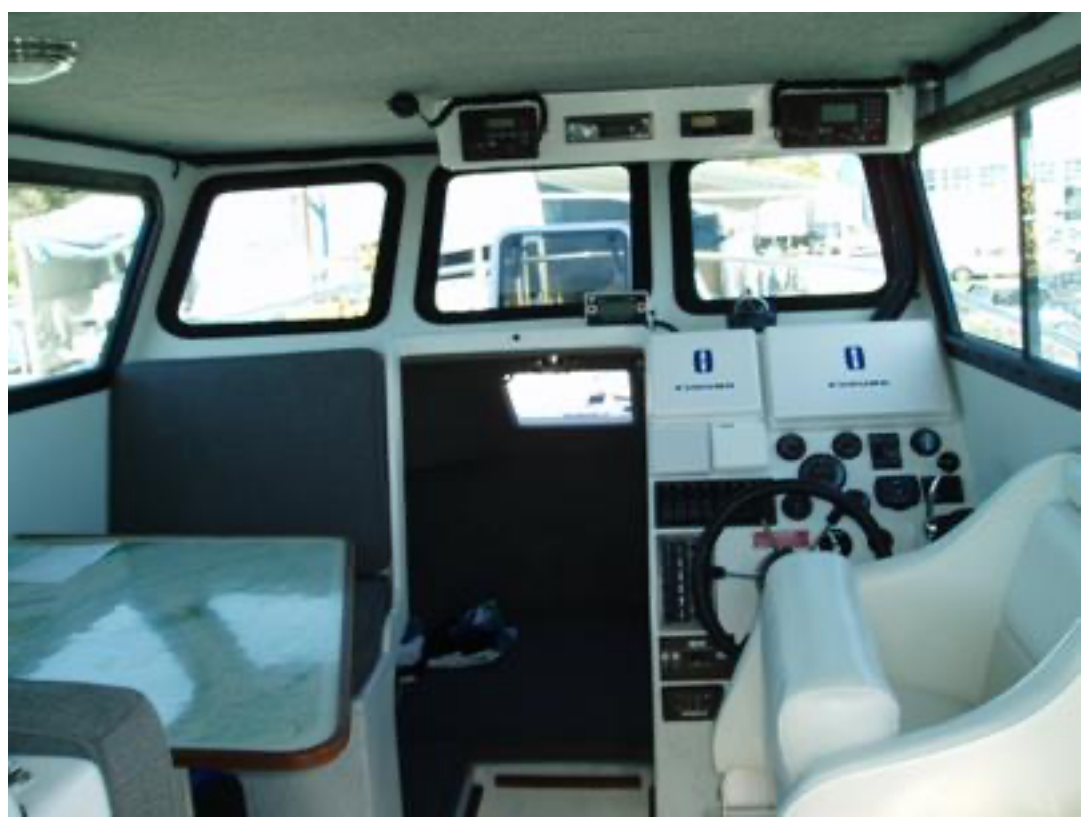
Interior cabin with dinette at left