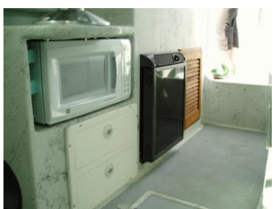
Microwave and fridge