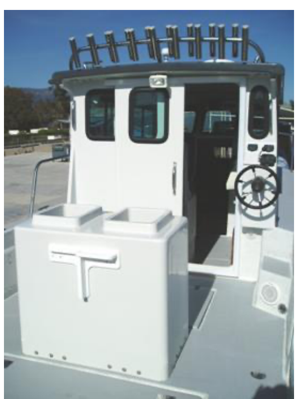
Bait tank and second station steering