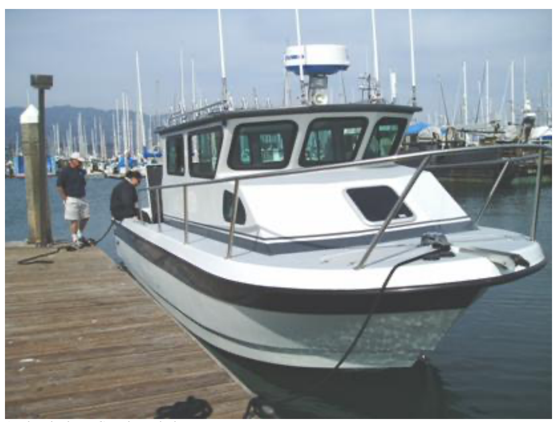
At the dock on first launch day