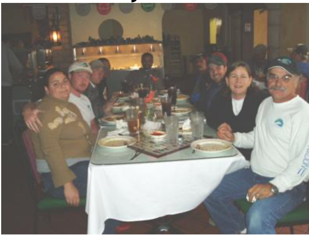
The Radon crew at Pepe's