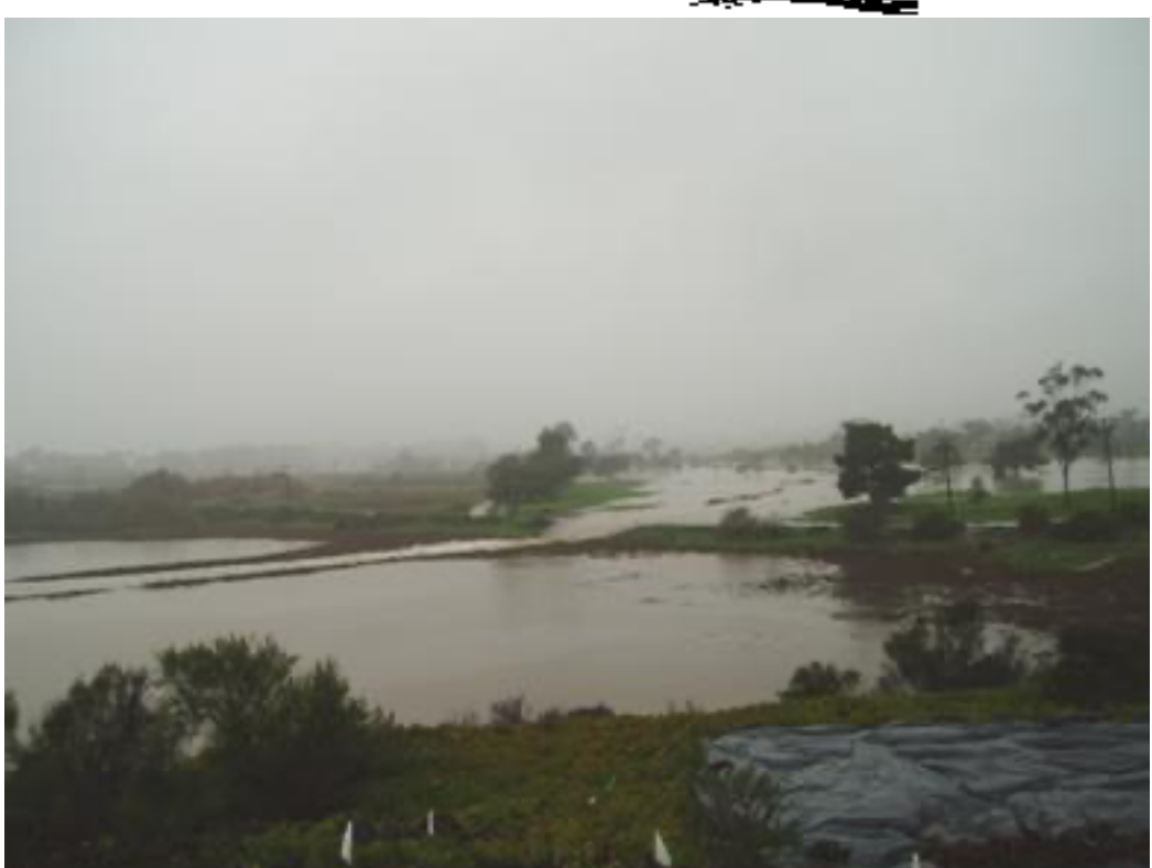
This photo was taken during one of the worst storms of 2005. That is a flooded golf course at right.