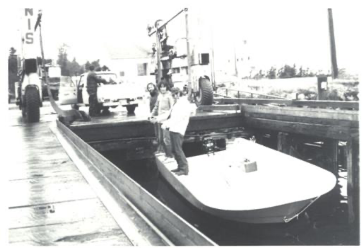
Port Townsend Washington, early 1970's, Don (closest) with crew showing the Radon boat's incredible stability

Radon Team is finished for now! See you next time!