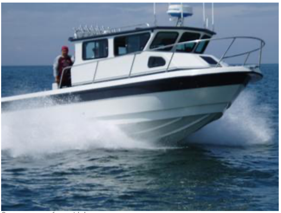
Our crew goes for a ride!