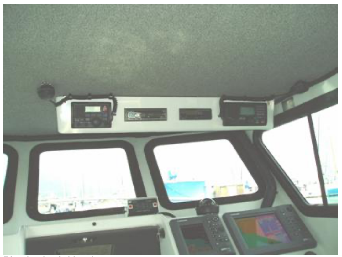
Fiberglass box holds radios, stereo