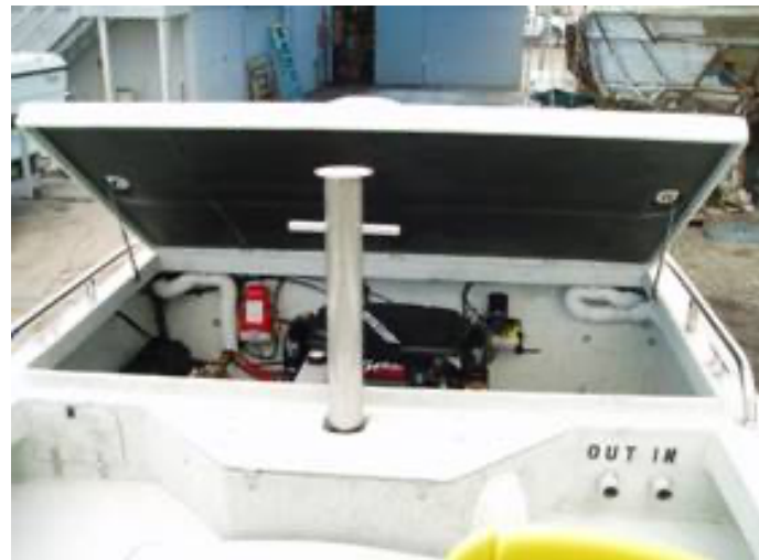
Samson post in front of engine compartment