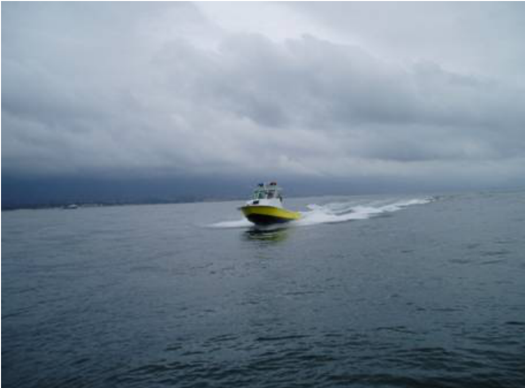
First sea trial in Santa Barbara....