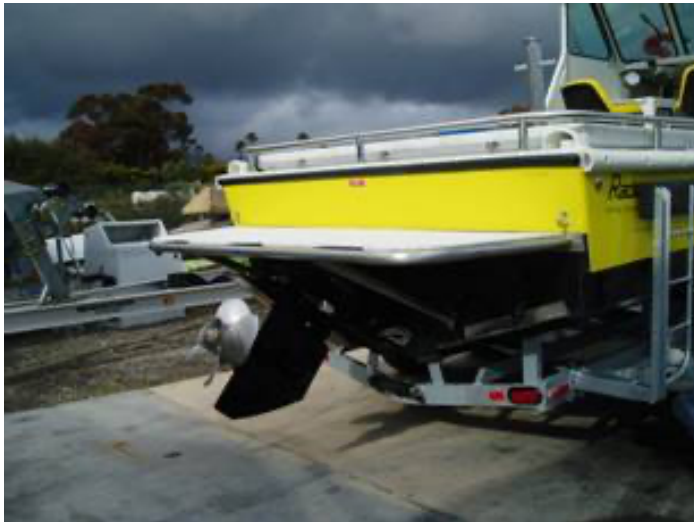
Transom view w/ swim step

This new fire fighting/ patrol boat has a Mercruiser 496 MAG HO, 425 HP 8.1 Liter engine with a Bravo 2 outdrive and a stainless four blade prop. It has a Hale fire pump and nozzle which can pump out 500 gallons of water per minute.