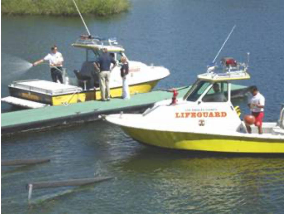
This photo shows a patrolman/lifeguard demonstrating how they use a hose to put out fires when they use the first lifeguard boat we built for L.A. County...