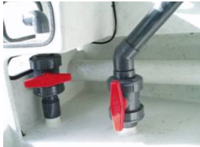
Water valves for the pump