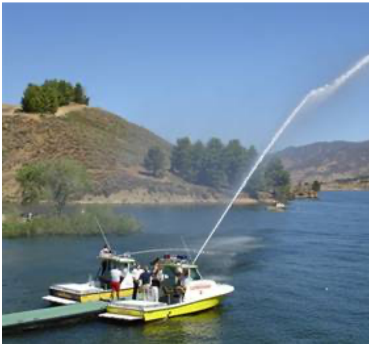
...in the second and third photos they are demonstrating how the fire pump works in the new boat.