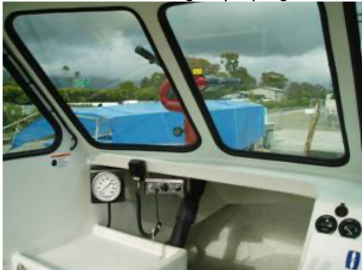
Water pressure gauge