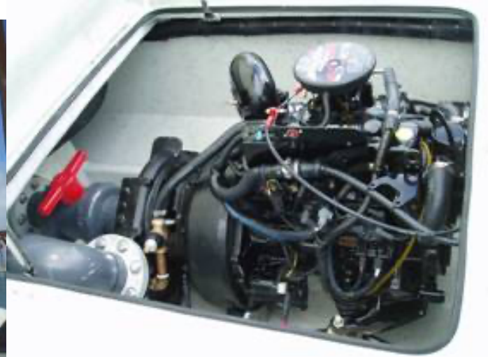
Fire pump engine compartment