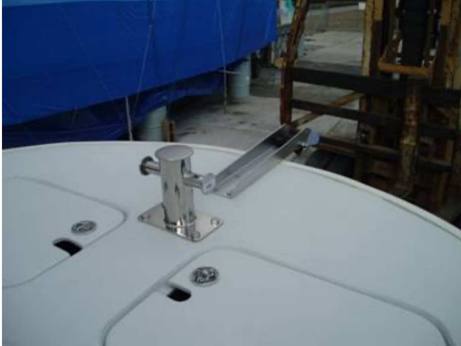
Samson post and bow roller