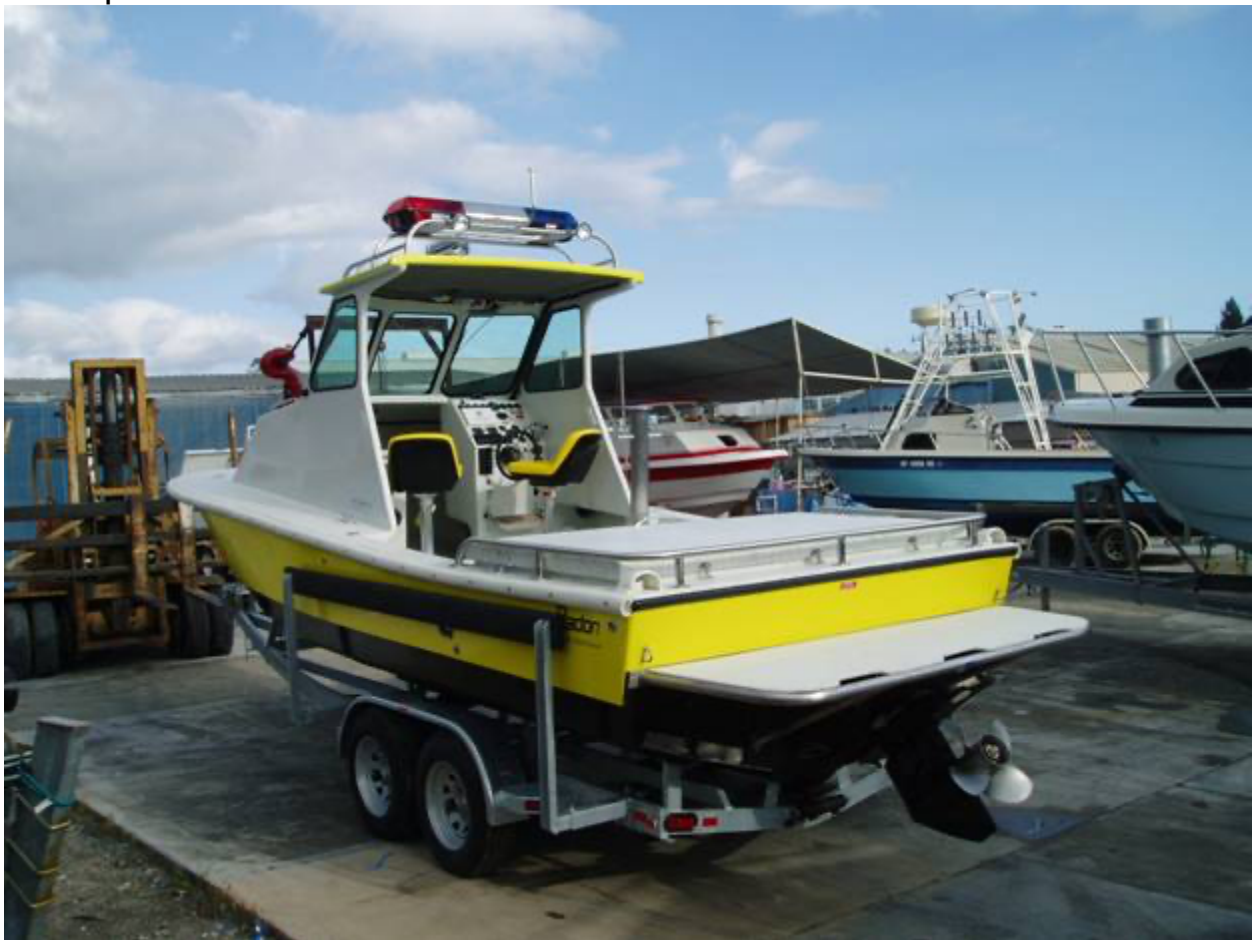
The new 22' awaiting the first sea trial