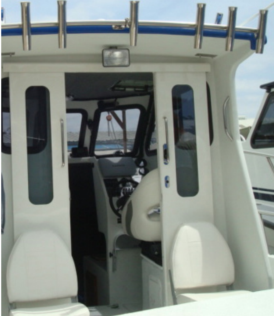
Bi-sliding doors on back of cabin, aft-facing seats and rocket launchers