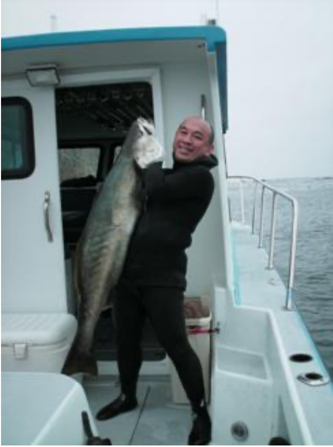
This one is 49 pounds