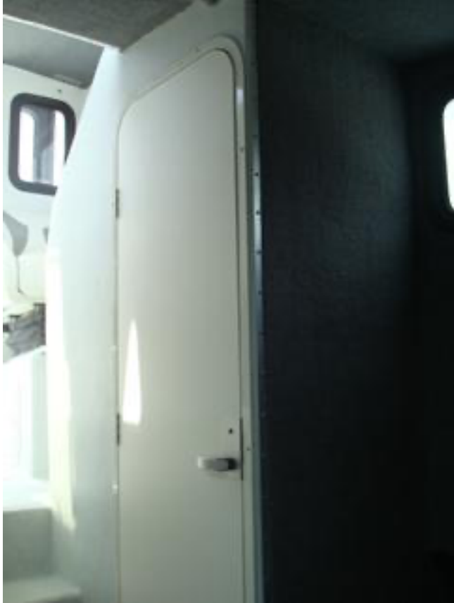
Head door in cabin