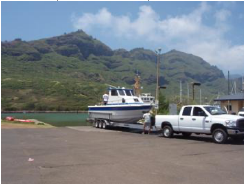
Time to launch on Kauai!