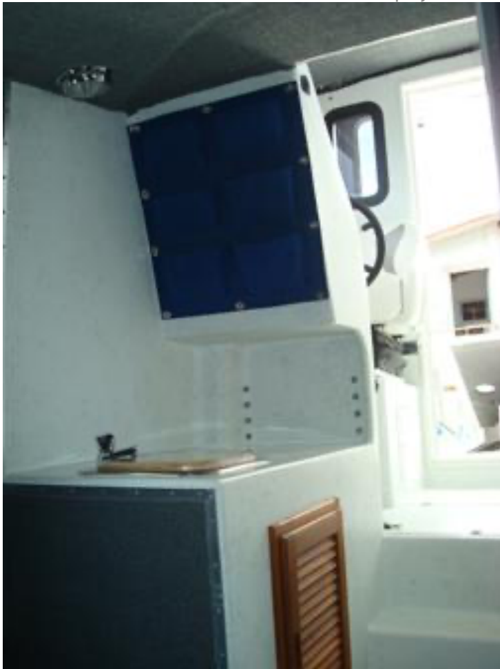
Galley with sink and storage