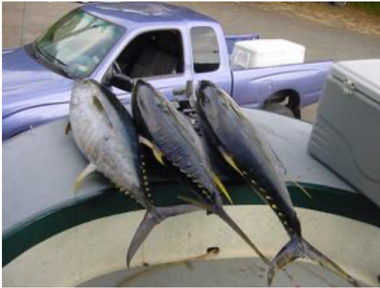
40 to 60 pound ahi caught off of the Windward side of Oahu last August