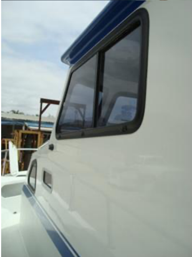
Flush deck with walk-around cabin