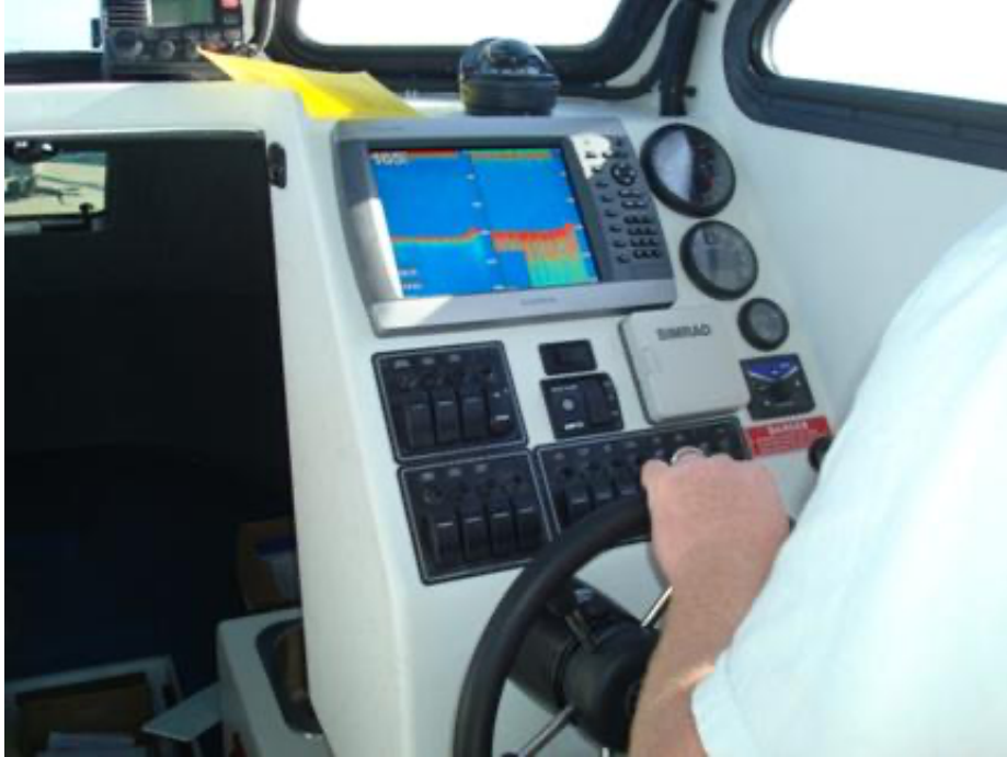
The dash with a Garmin 4212 multi-function display