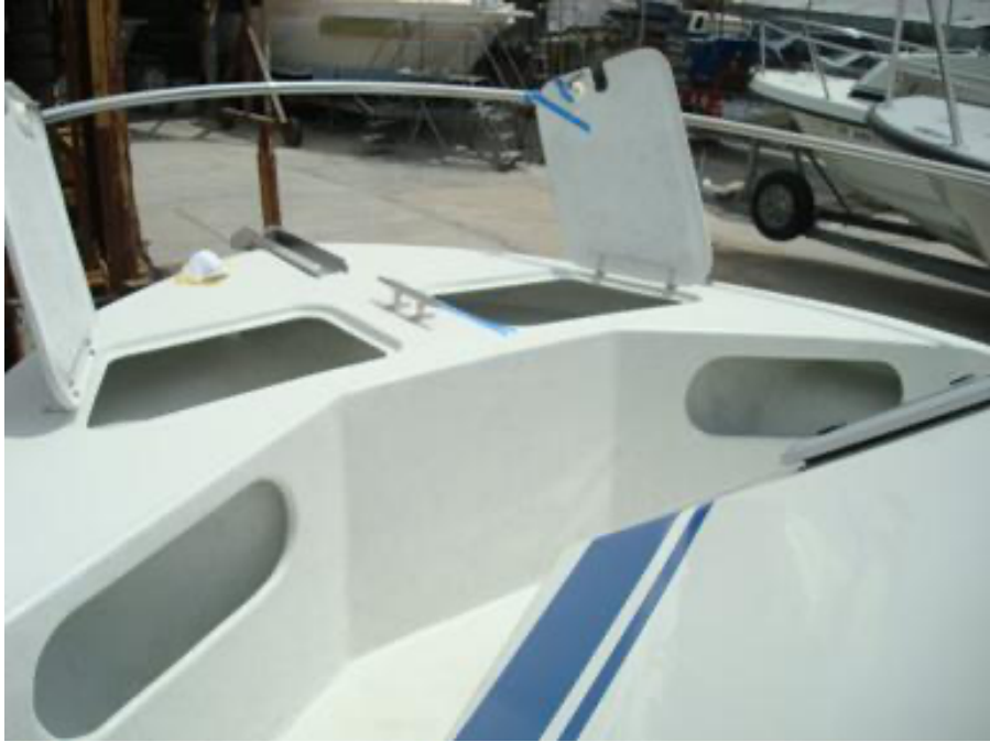
Front of cabin with anchor lockers and line storage compartments