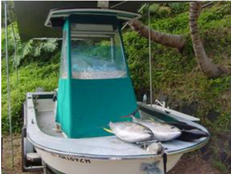
"Audrey Marie" - 17' Radon