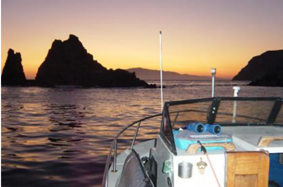
Cat Rock on Anacapa Island Santa Cruz Island