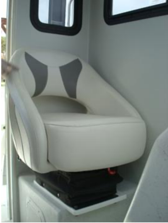
Passenger seat with suspension base