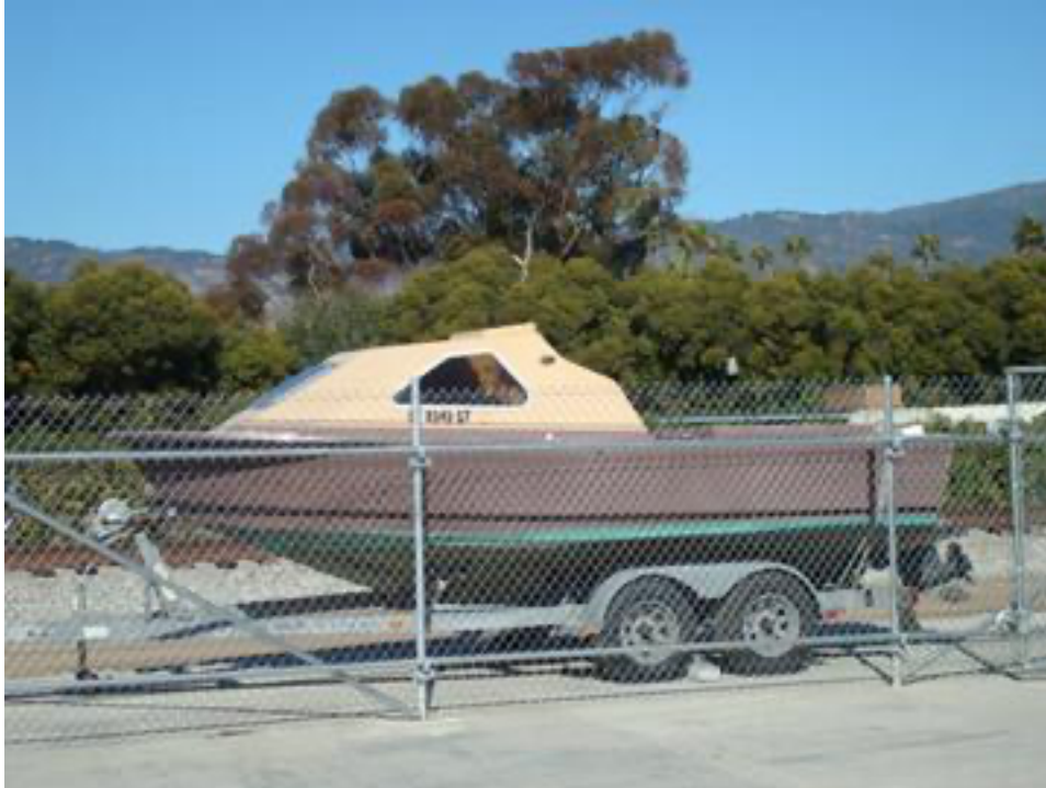
Above - the "before" photos and after...