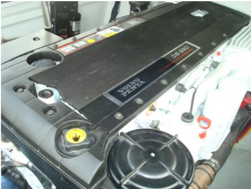
Single Volvo D6 330 HP engine