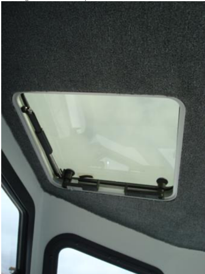
Ventilation hatches above helm and passenger seats