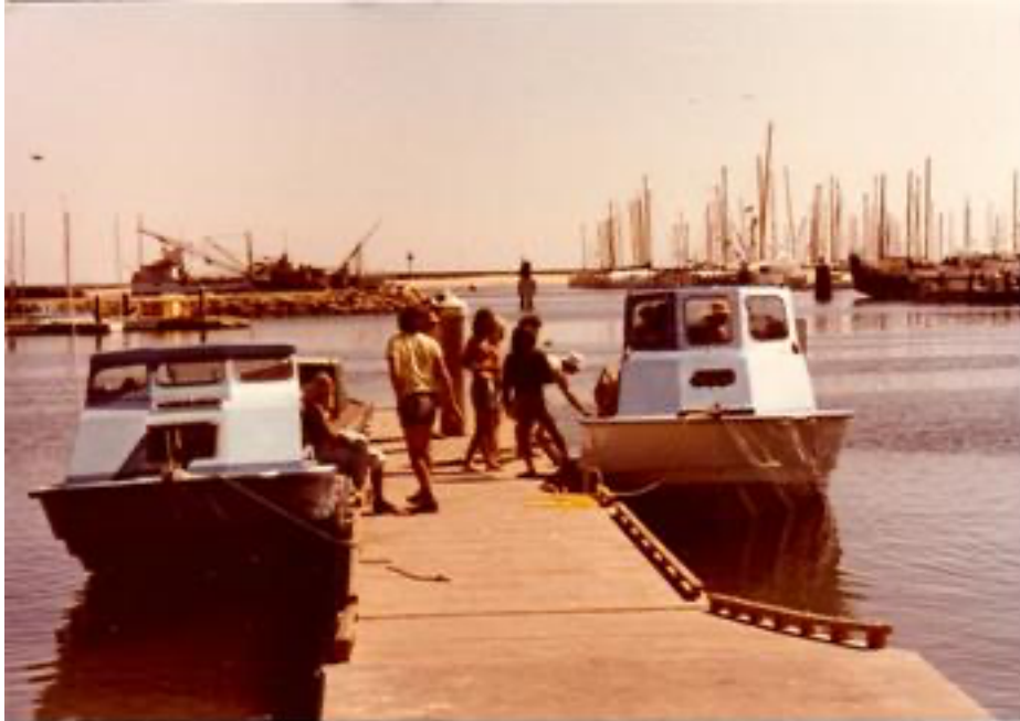
October, 1979 - on the left is a new Radon 26' x 8' and on the right is a new 27' x 9'