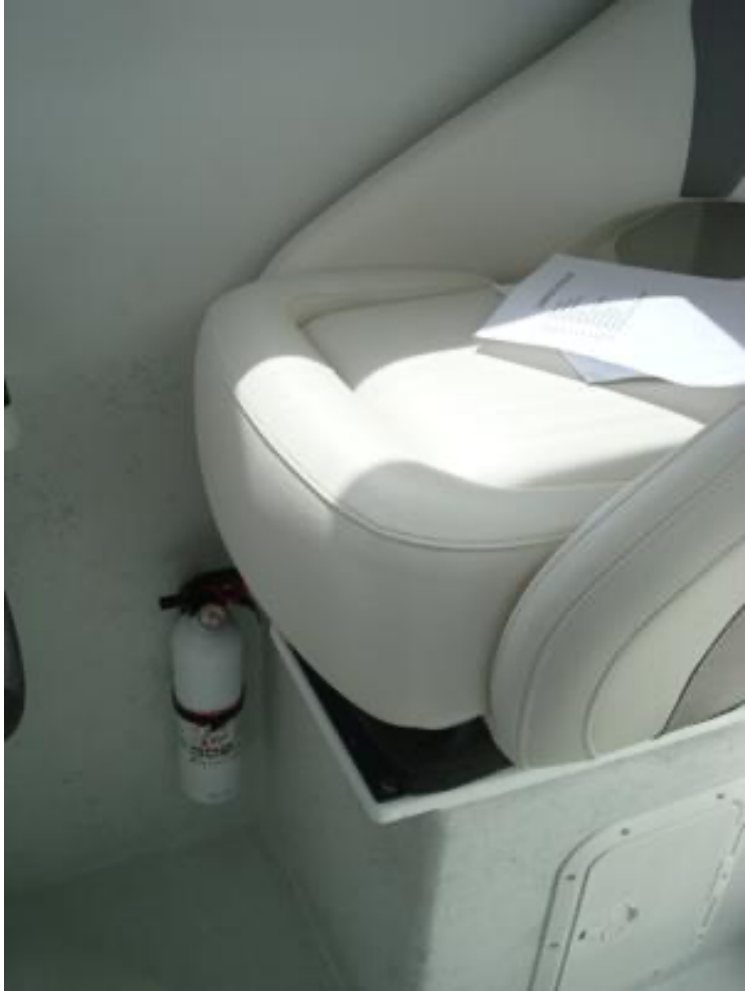
Helm seat with suspension base