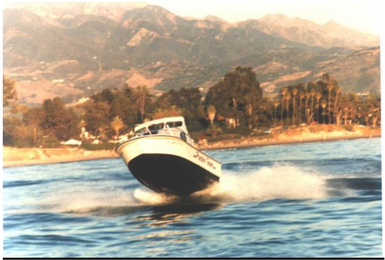
This photo of our 17' Radon was taken off the coast of Santa Barbara in the mid 1980's. If you are not able to read the side of the boat, it says "Radon Team" The more things change, the more they stay the same!