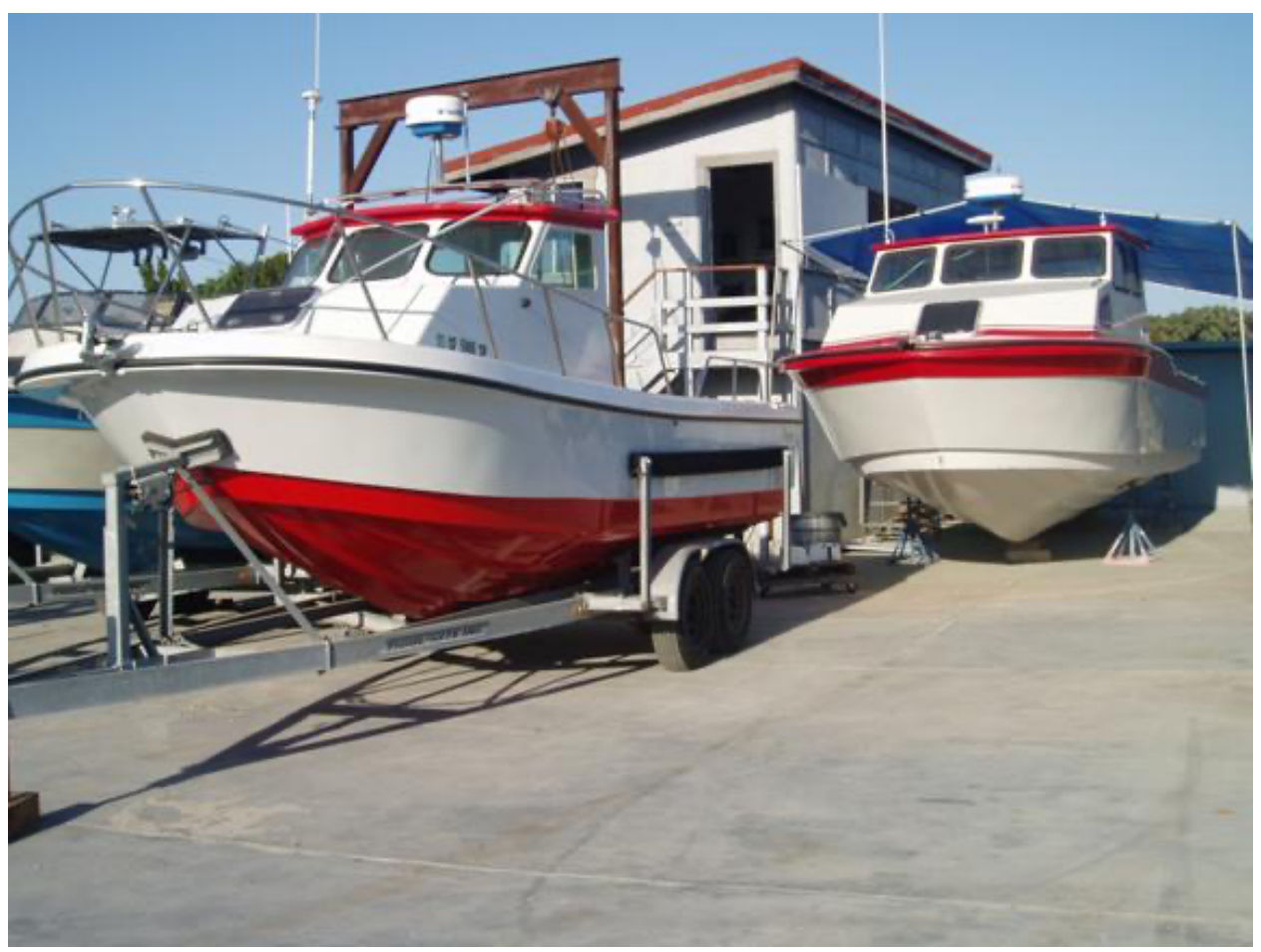
Here you can see the Radon 33' in the background. In the foreground is the 33' customer's first Radon 22'.