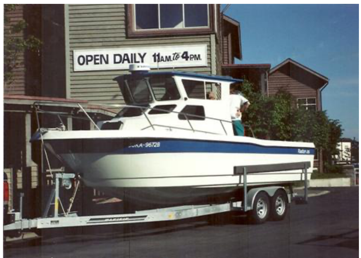
This is a 25' we built for Dan Nieman in 1990. We trailered it all the way to British Columbia for