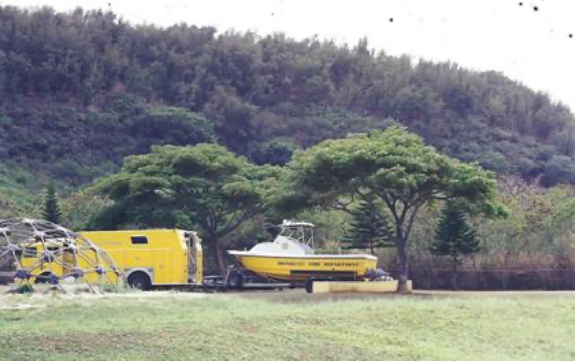
The photo above was taken by Matt Moore, surfboard maker extraordinaire, while he was vacationing on the Island of Oahu. It shows the Honolulu Fire boat we built it 2000.