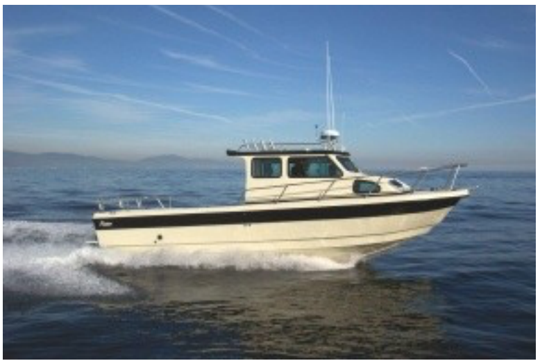
Closed marine cooling systems, a.k.a fresh water cooling

Marine fresh water cooling systems are similar to the cooling system in an automobile, but instead of a radiator to remove the heat generated by the engine, a heat exchanger is used. The heat exchanger uses the ocean water to cool it. This keeps the ocean water from running through the block. Running coolant through the block rather than saltwater helps reduce corrosion. This system also allows the engine to run at a slightly higher temperature which also makes it easier to regulate emissions.