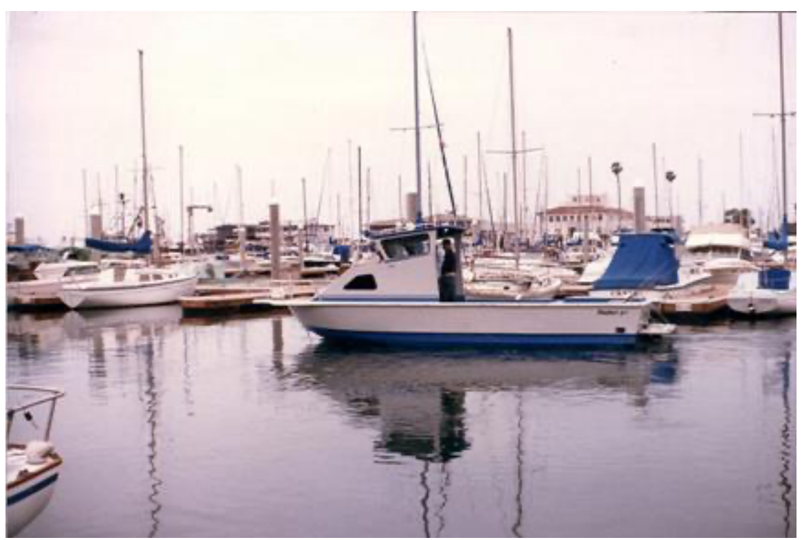
Loren Bracci's 27' x 9' - built in the mid '80's