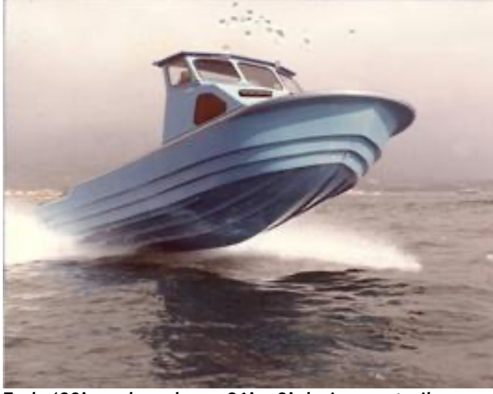
Early '80's - a brand new 26' x 8' during sea trails