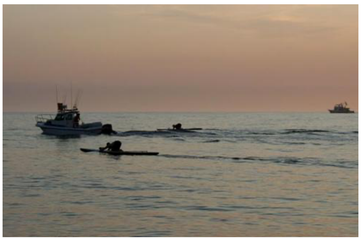
Tony Hotchkiss' 22' Radon accompanying paddlers during the 2009 Catalina Classic Paddleboard race, Catalina island to Manhattan Beach pier, 32 miles.