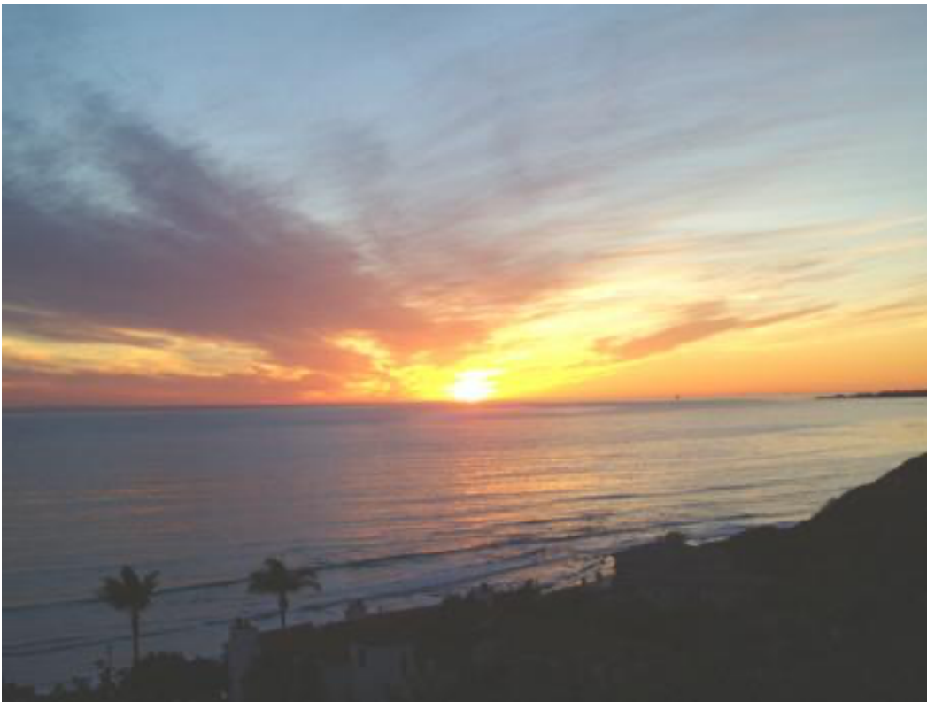
Sunset at Hope Ranch Beach, February 2004