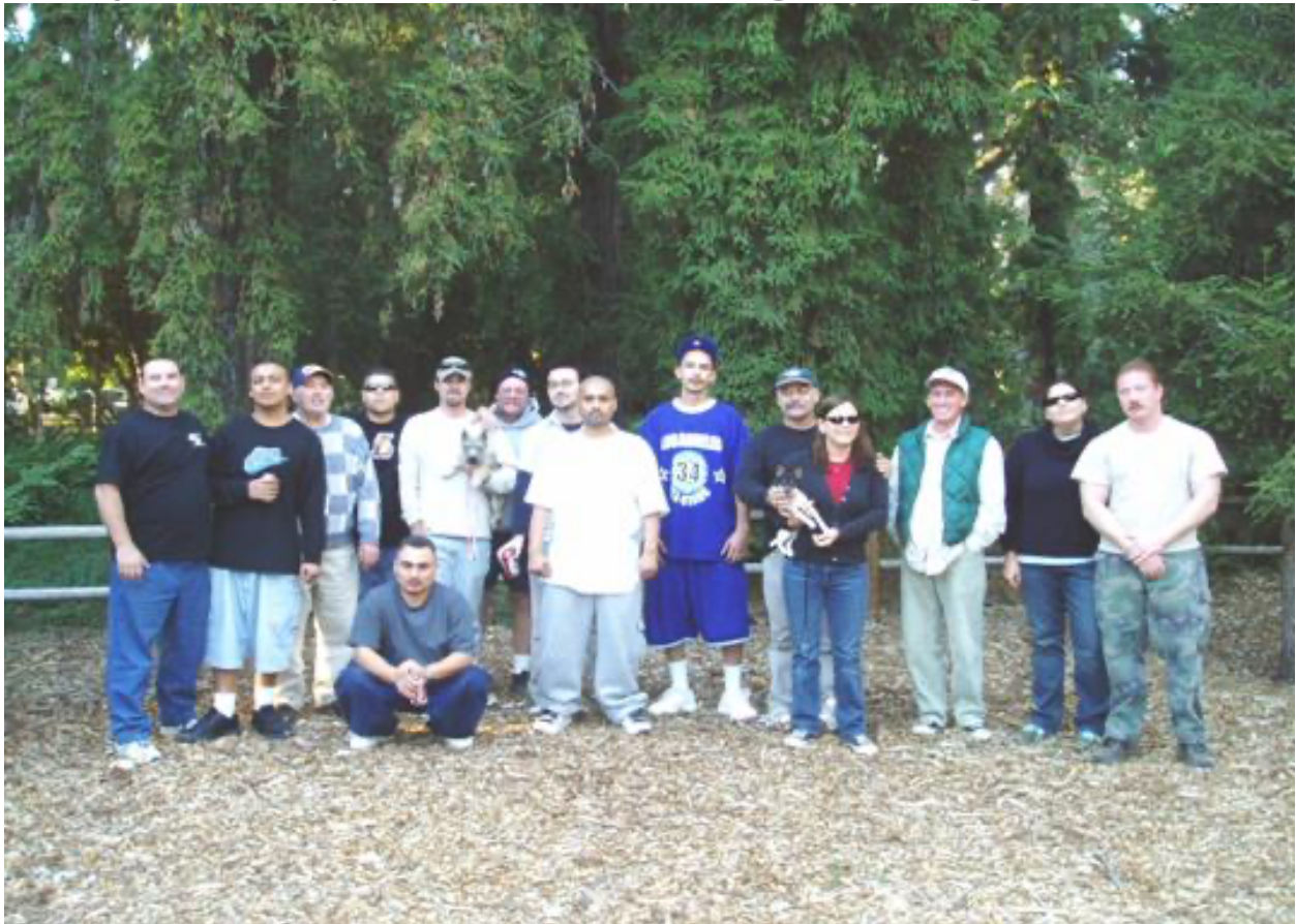
The Radon Team