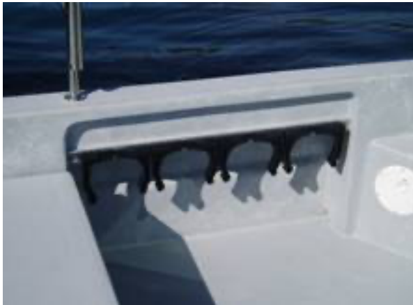
The Lang's tank rack...

We recently delivered a custom 29' Radon to Tom and Susie Lang, experienced boaters and divers. Their boat featured many custom touches; a stand-up head with shower and sink; galley area with stove, fridge, microwave, and sink; and tank racks built right into the boat for easier accessibility. This new 29' Radon is powered by twin 200 HP Volvo diesel engines, which easily got up to 30 knots and also has a state-of-the-art Raymarine electronic system. Fortunately, Tom is very adept at using the complicated electronic system.