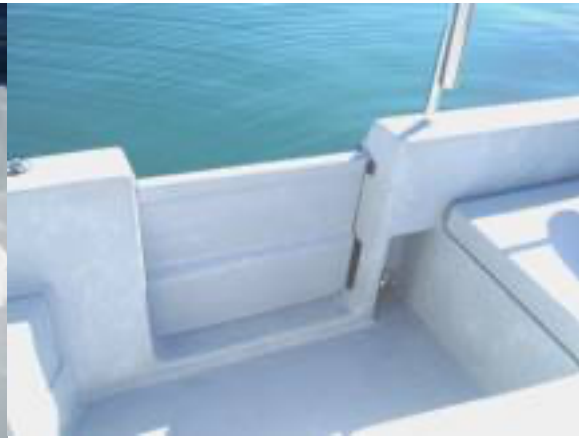
side dive door...