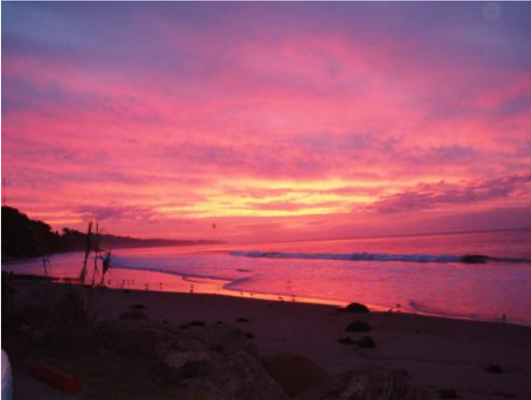
Sunrise at Goleta Beach, January 2004