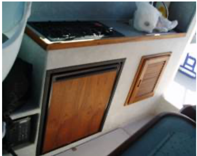
counter w/ stove, sink, fridge, & microwave.