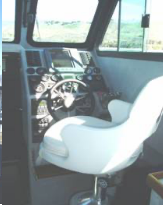
Swim step, dive ladder, bait tank & transom cut out... helm station...