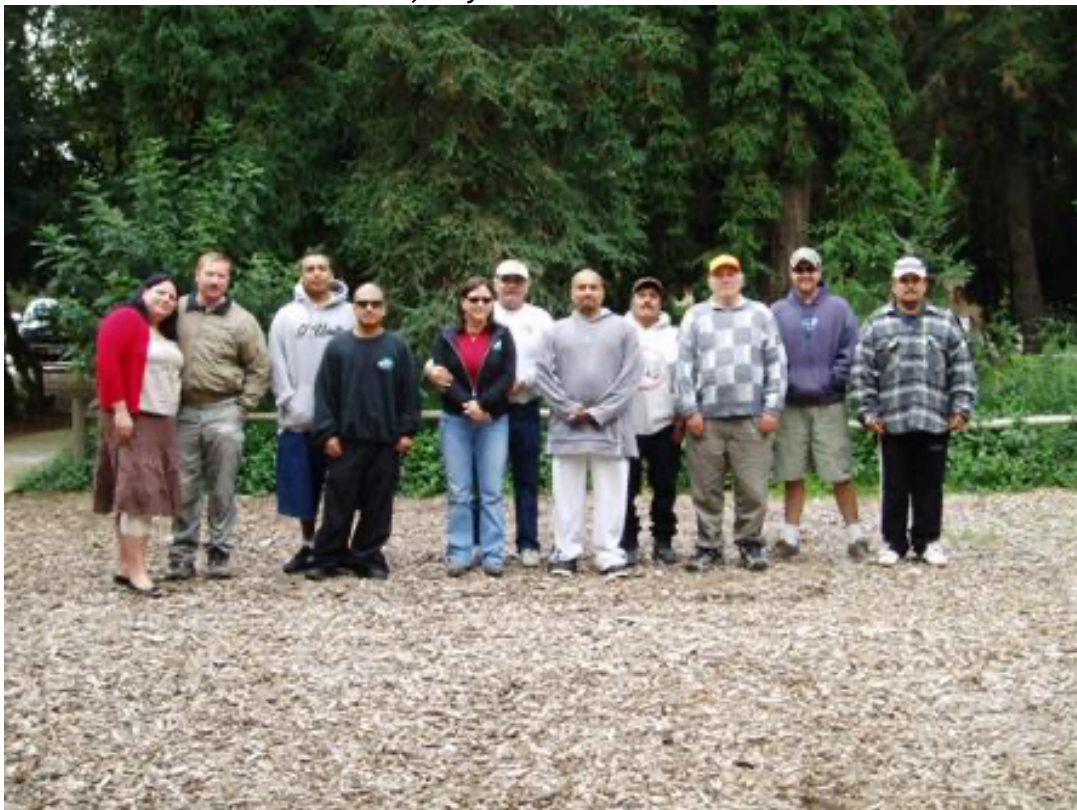
Our crew at Stow Grove Park, December 2005