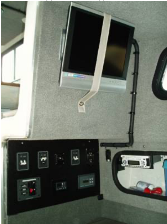
TV secured for cruising (above) AC panel (below)