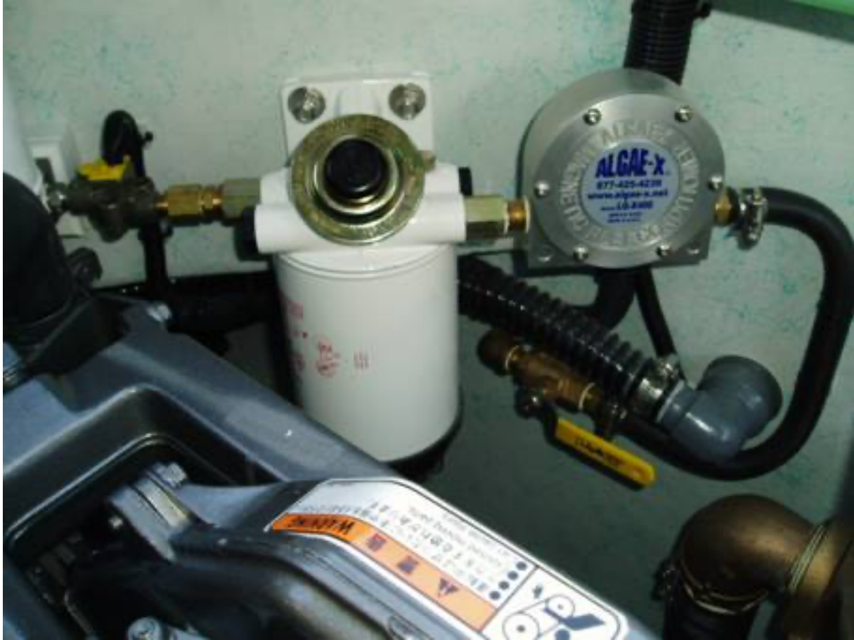
Here is a photo of the Yanmar fuel filter with an Algae-X fuel conditioning system