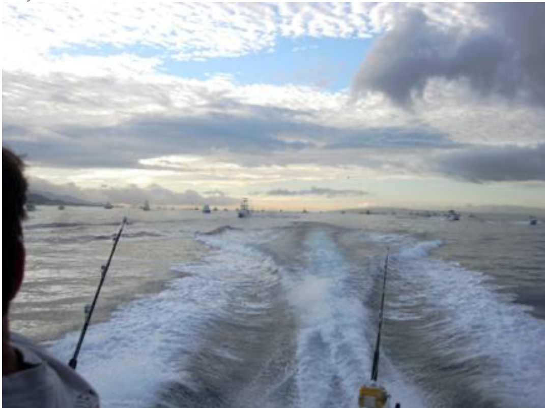
and David's boat is leading the pack