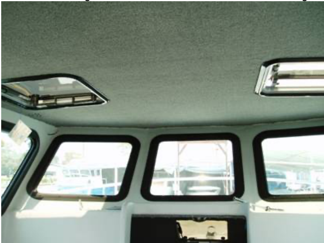
The cabin roof has two vent hatches The boat arrives in Maui!