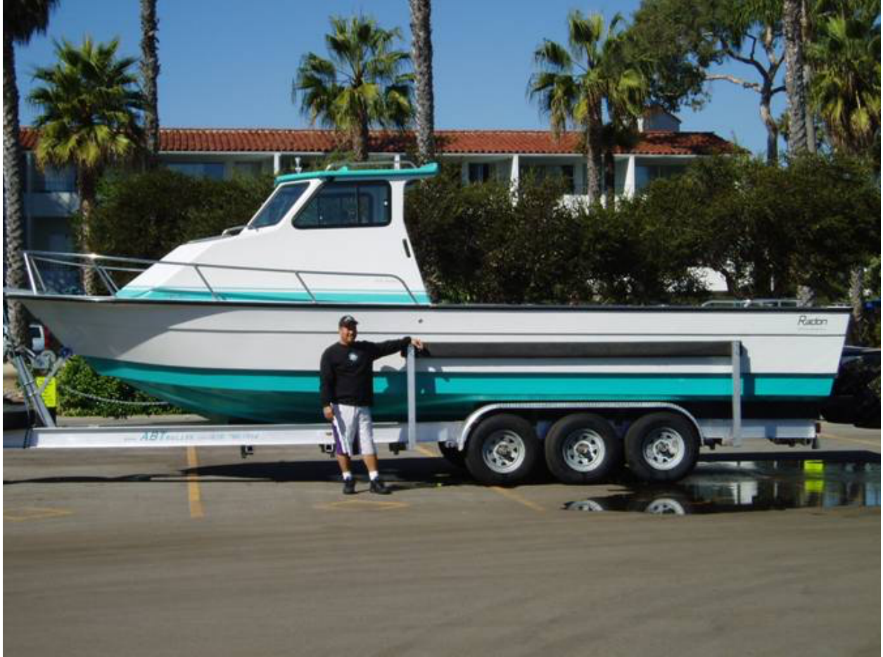
Here is Todd with his boat all loaded up and ready to head back home

#3 Featured boat - Rex and Lori Honl's 33' Radon