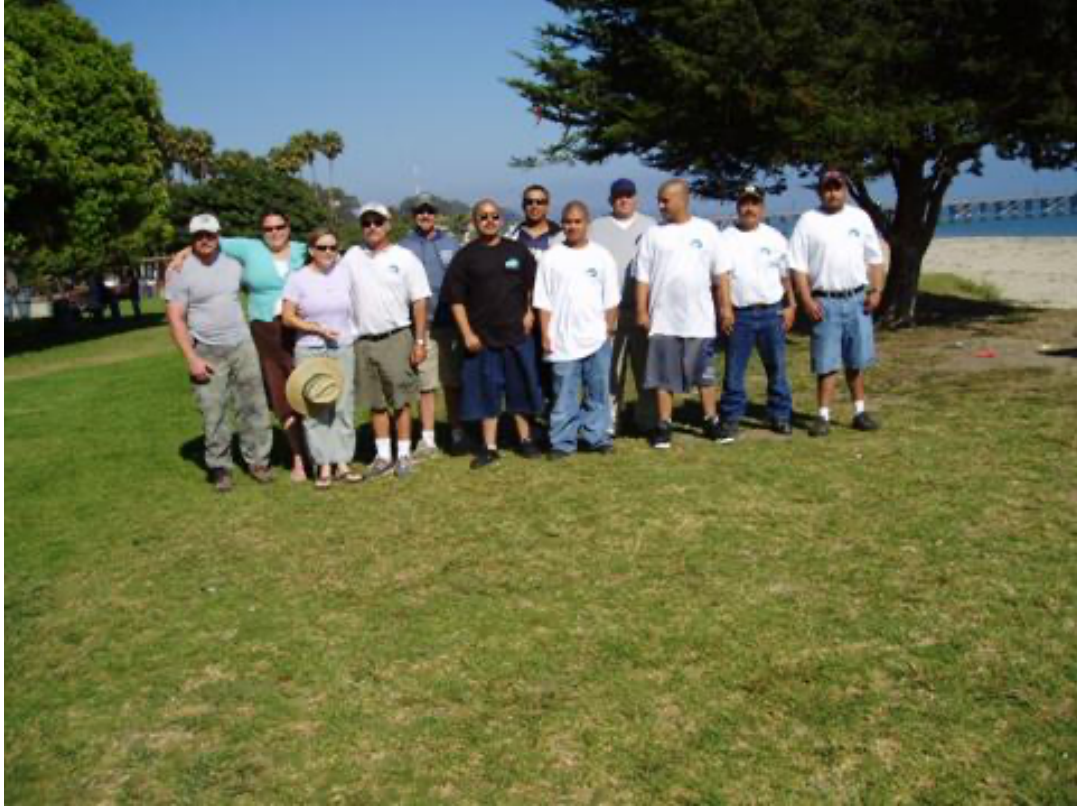
The Radon crew at Goleta Beach, July 2005