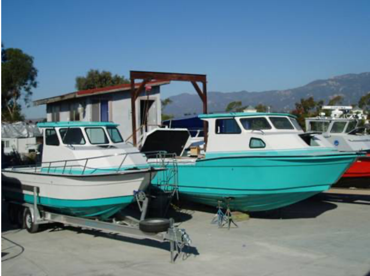
The Hawaii bound 29' and 33' Radons