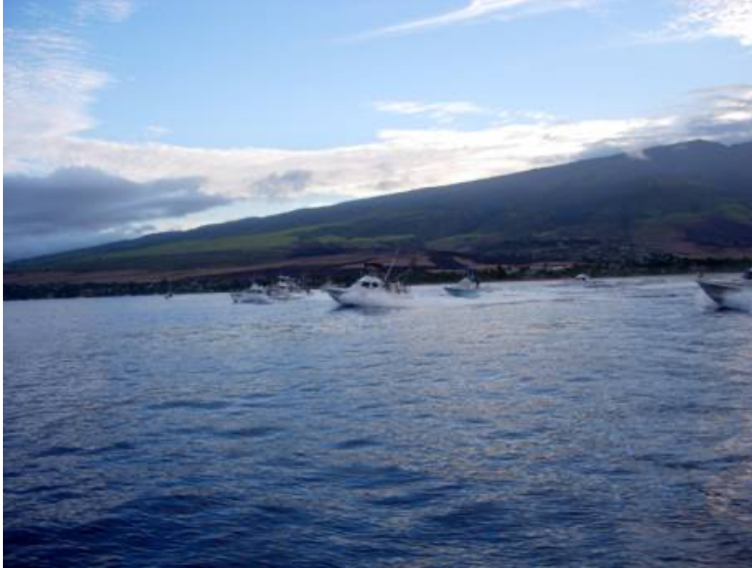
Here is a photo taken at the Halloween Shootout tournament in Maui. They were the fastest off the start out of 75 boats...