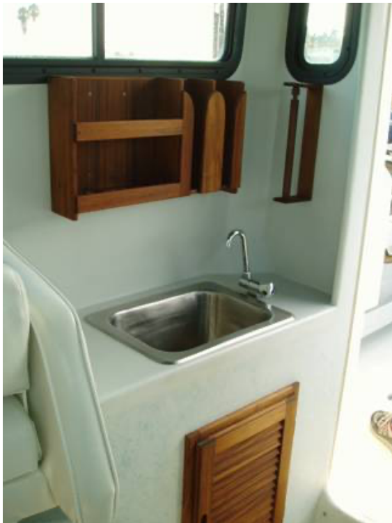
Sink in galley area