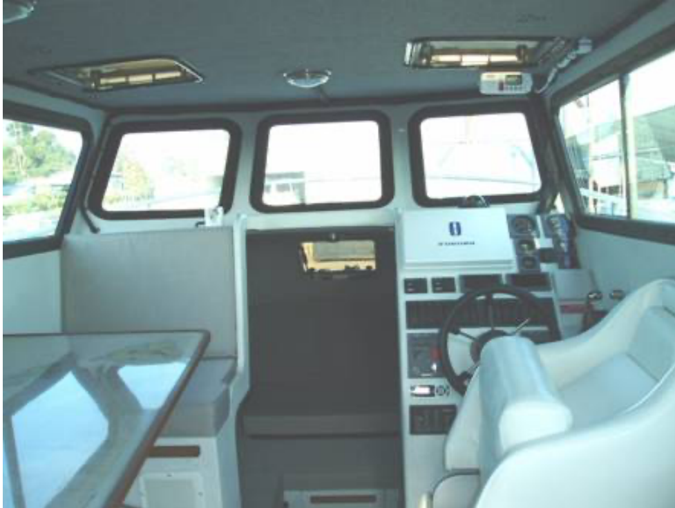
Cabin interior with helm seat on right and table with map of Hawaii on it on left

Other features include a galley area with sink and microwave, TV/DVD player, and removable fly bridge with bimini top. It is definitely one of the most elaborate boats we have built for use in Hawaii!