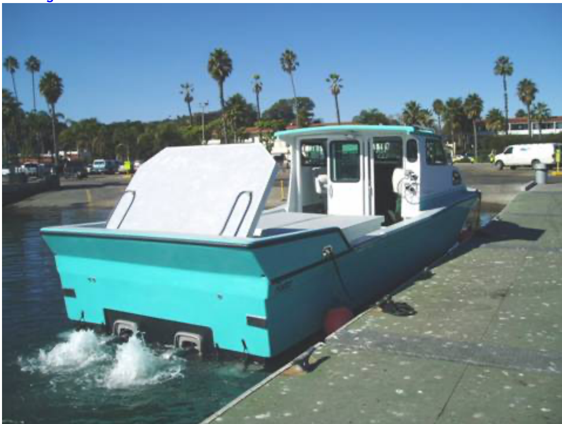
Warming up at the Santa Barbara launching ramp