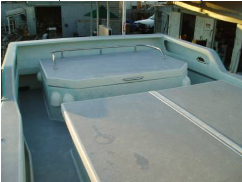
It also has a raised, split, fish hold and walk around engine compartment with stainless rail. The iki mau is between under the deck between the engine compartment and the fish hold