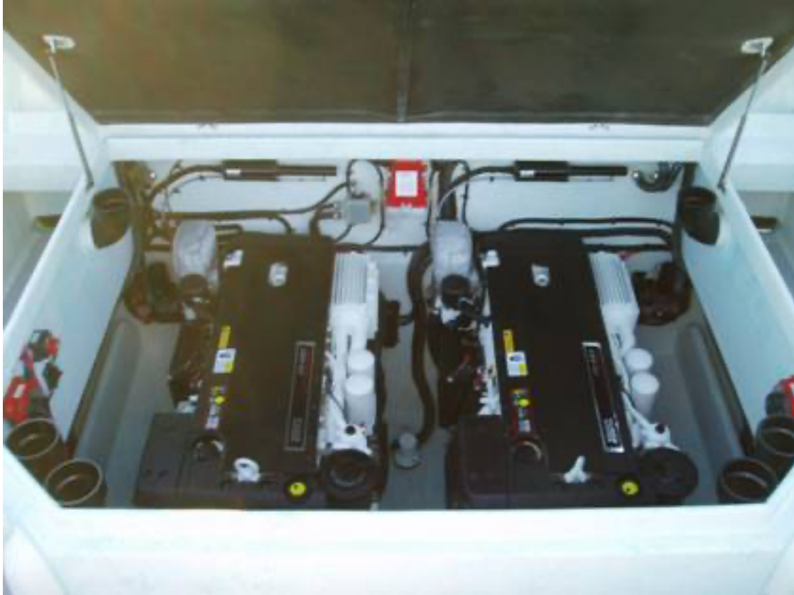
The Honi's boat is powered with twin Volvo D6 350 HP diesel engines