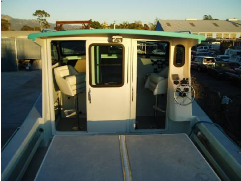
There are two sliding doors on the rear cabin, pilot seats on both sides as well as second station steering