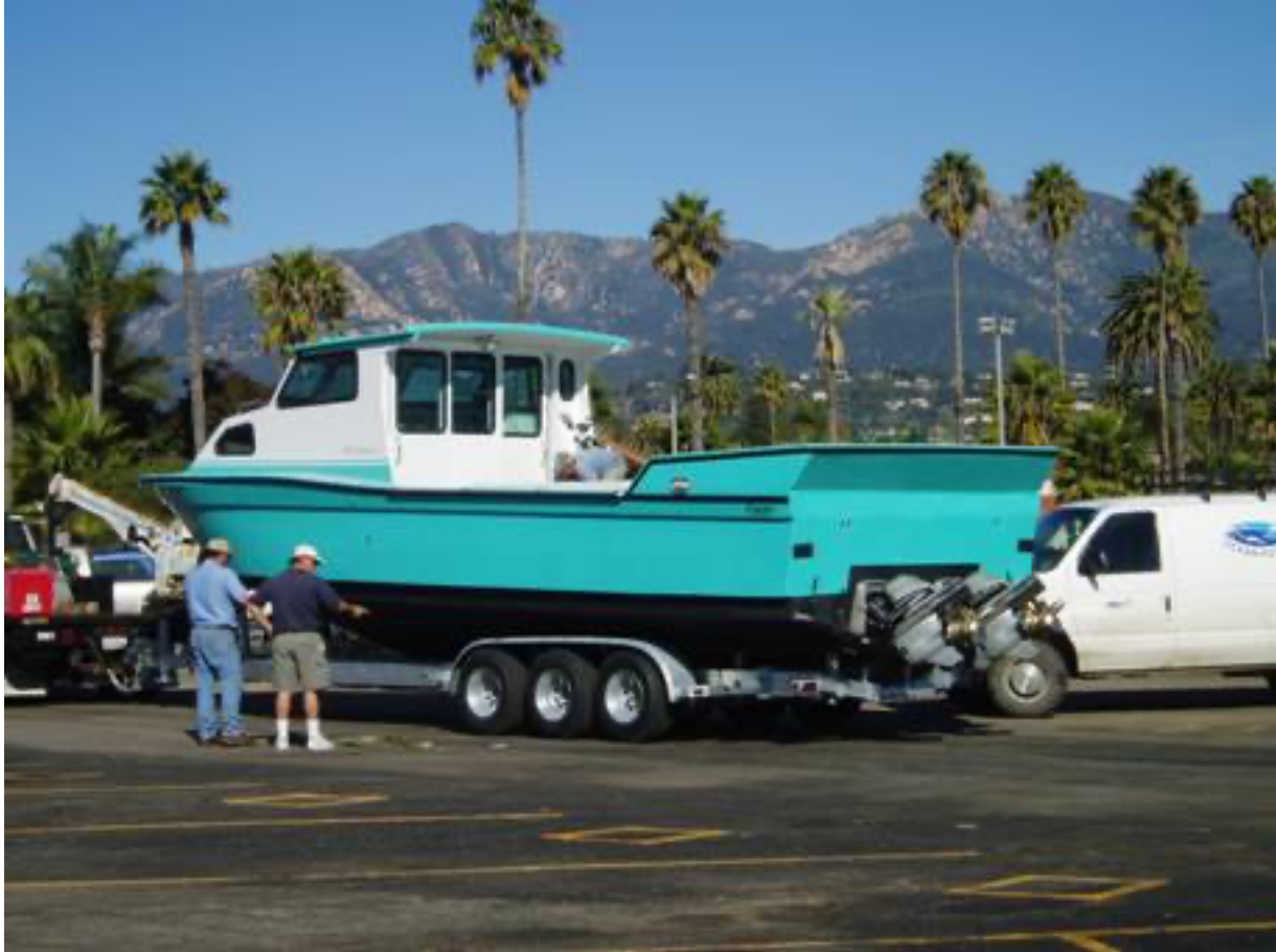
The Honi's 33' has a unique "whale's tail" design - a raised stern