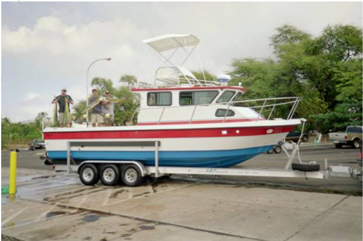
The first day of fishing in Hawaii with the new boat -they caught lots of mahi-mahi