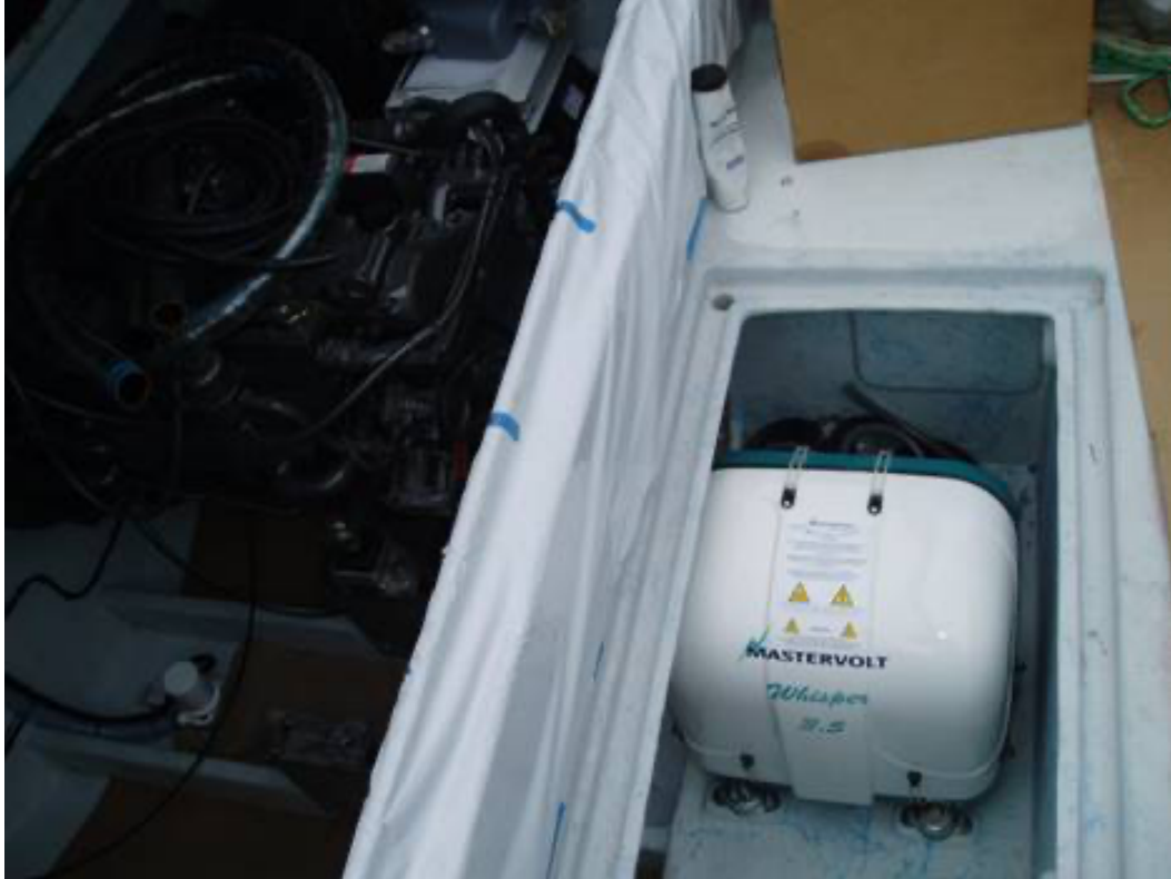
This is the 3.5 KW generator we installed to run the air conditioning unit