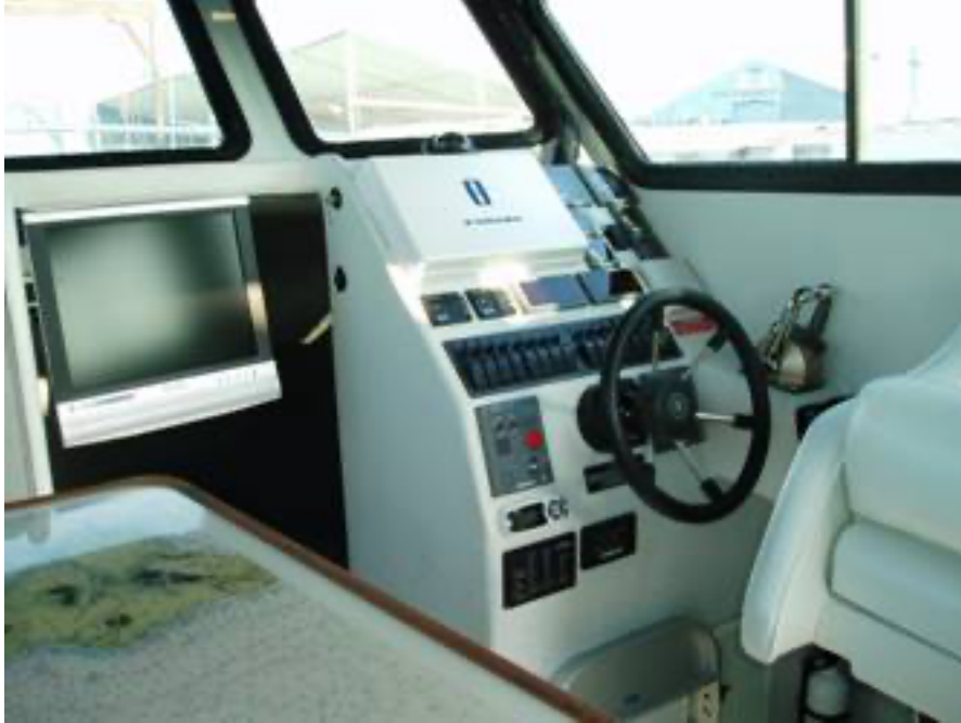
TV in viewing position for upper cabin