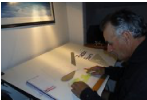
17' Radon restoration project