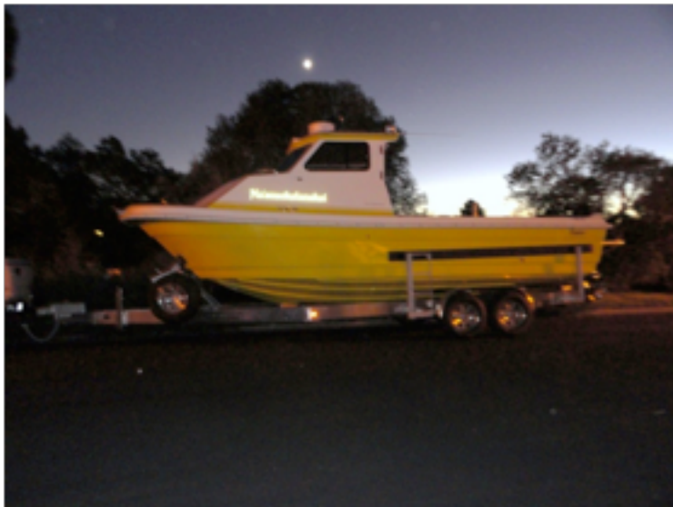
The boat attracted a lot of attention parked at our house the night before our trip to San Diego. Notice the reflective stickers.