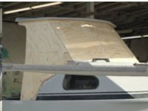
Jeremy starting the overhead... The overhead is attached