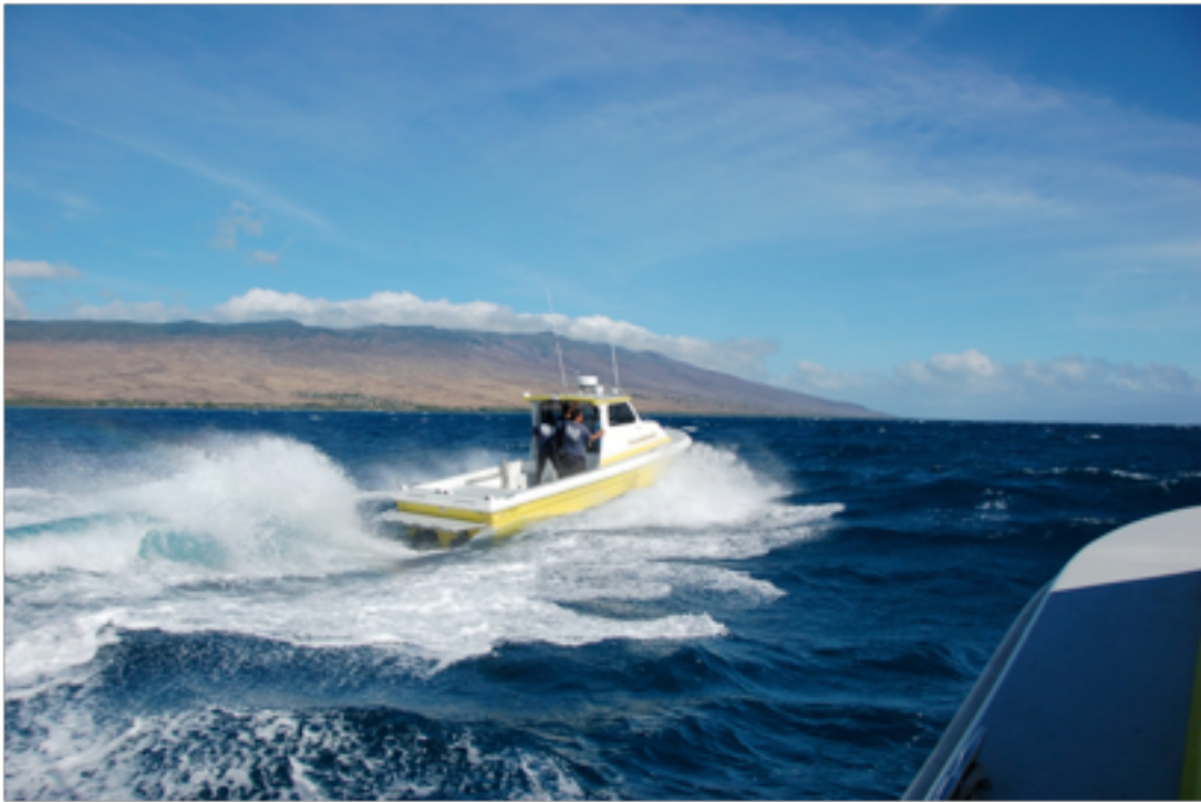
Sea trials in Molokai