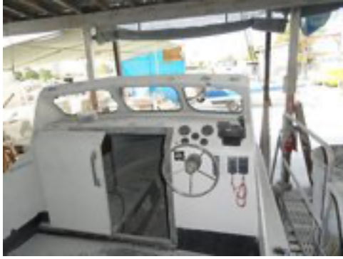
The 17' before we de-rigged