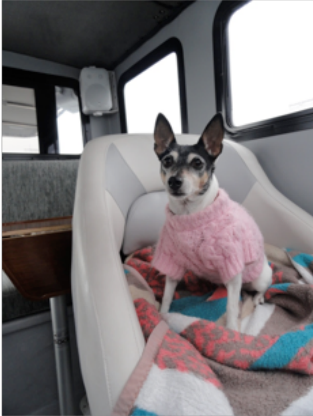
Cassie loves boating too!