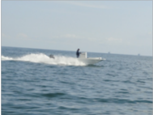
Tom Chung’s 29’ Radon gets an extended overhead