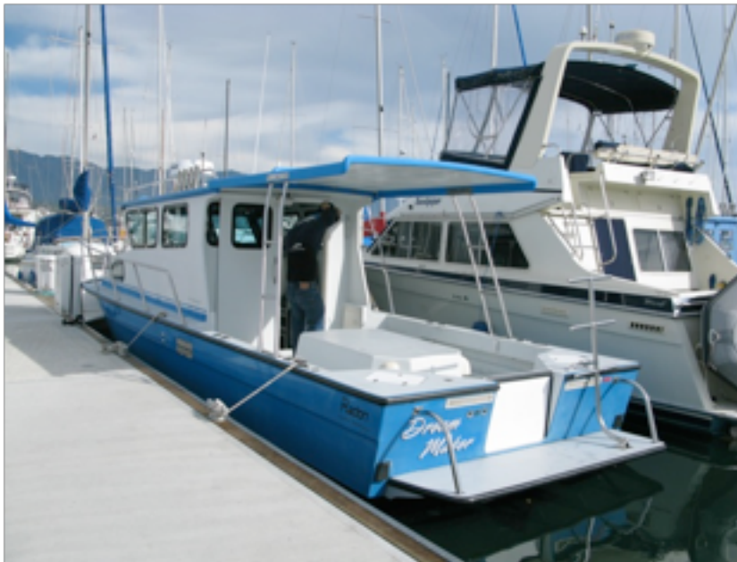
Project complete! In a slip at the Santa Barbara Harbor!