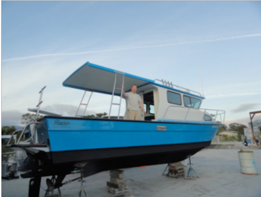
Jeremy with the new stainless supports built by Dan Shannon Stainless