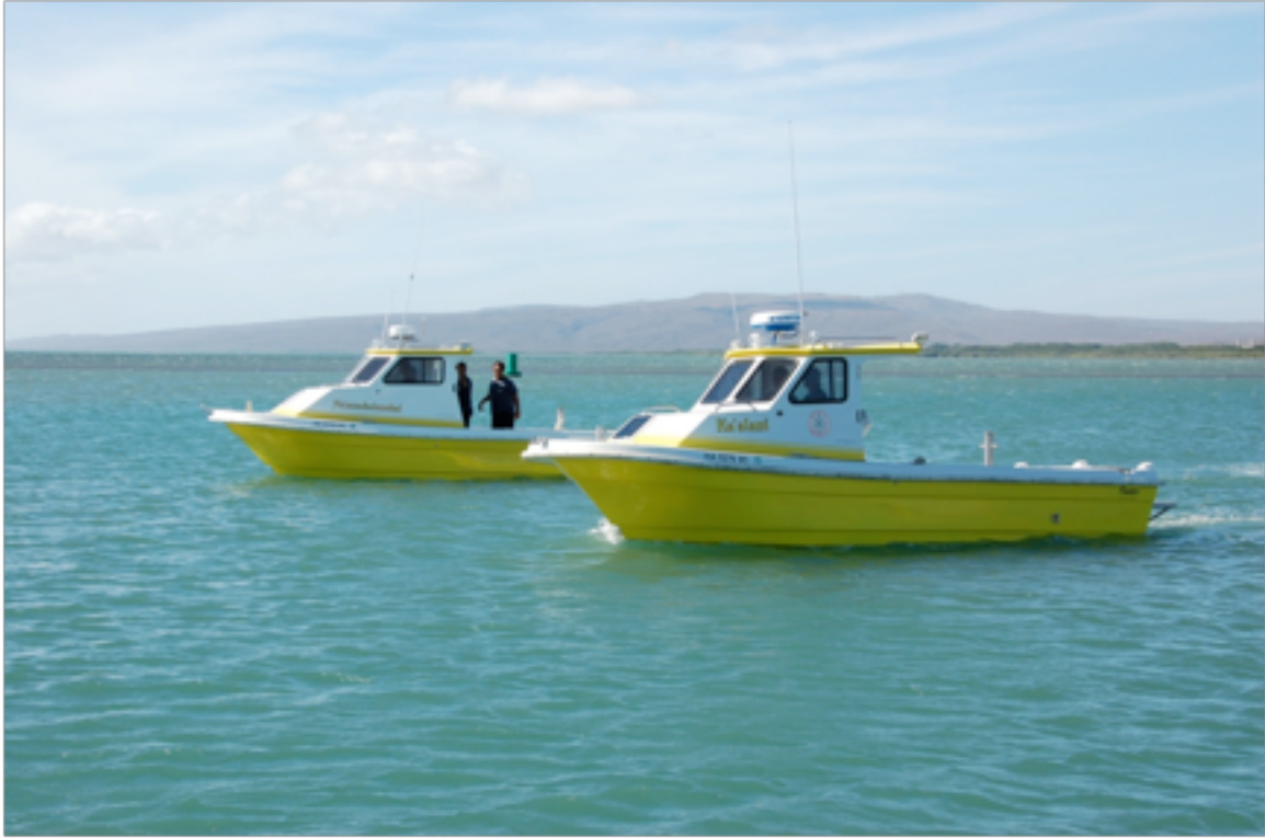
Above and below - the 2008 Maui Fire Dept. 26' Radon and the new Molokai 26' Radon