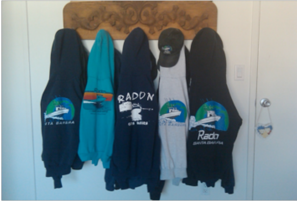
This is what hangs on our coat rack!