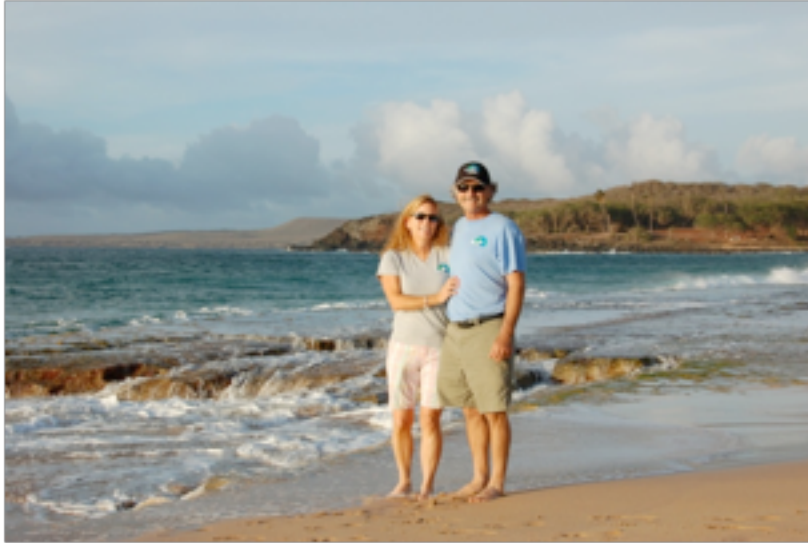
On the beach on Molokai after the sea trials were complete. Molokai is a beautiful island and the people there were very friendly.