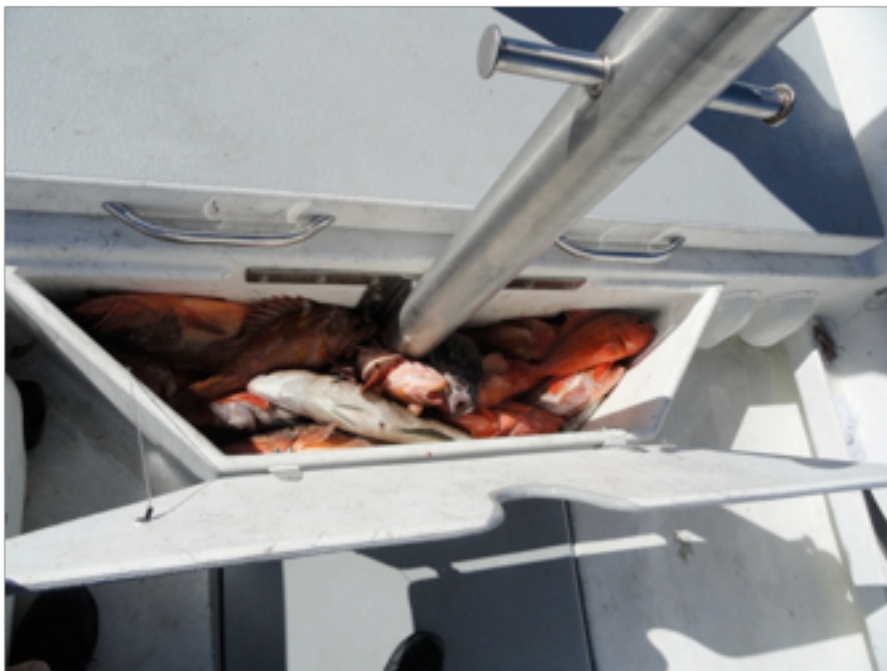
A unique use for a rope locker