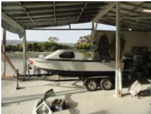
The windshield is off!