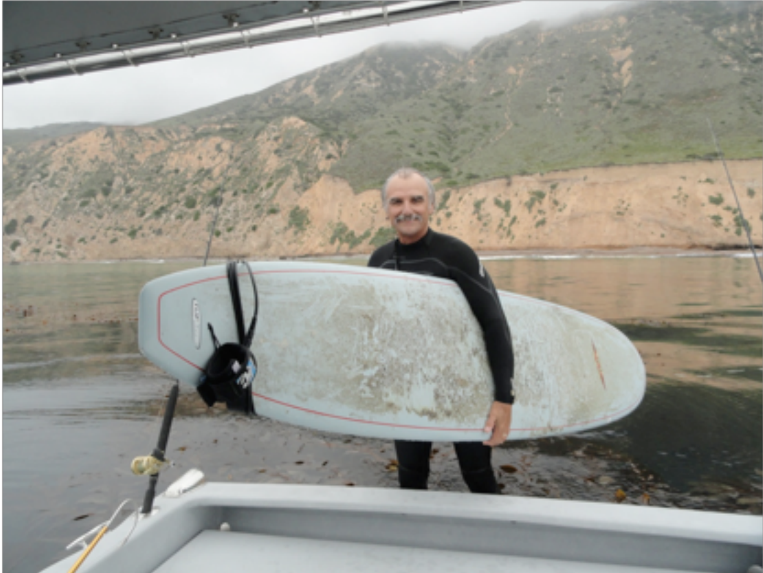
Don was one happy daddy!