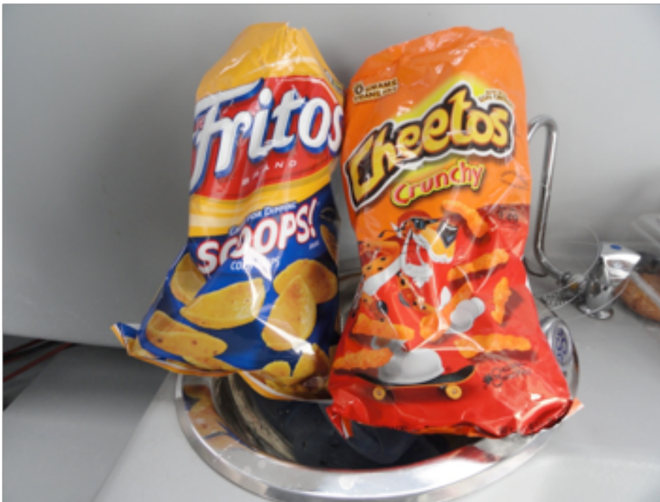
Required snacks for a fishing trip